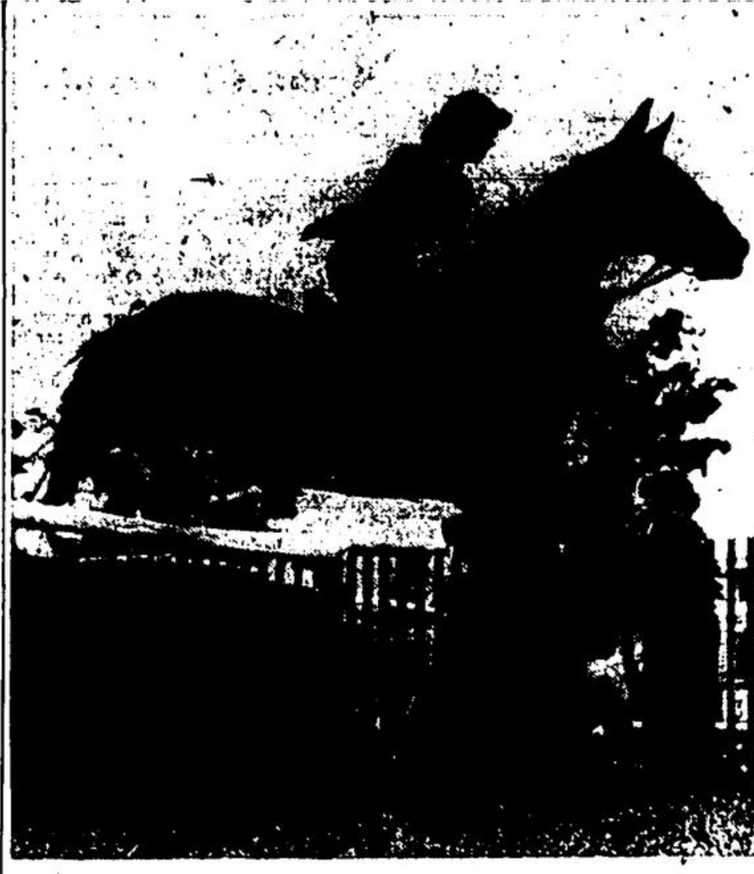
CLEARING A JUMP at the Brampton fair is Miss Jill Frame mounted on Norabel, one of the Glenspey Farm horses. Glenspey Farm is located on No. 25 highway south of Speyside. Miss Frame is competing in a hunter competition in this picture. The Glenspey stable of 3 horses now has 125 ribbons to its credit with 31 being won this year.