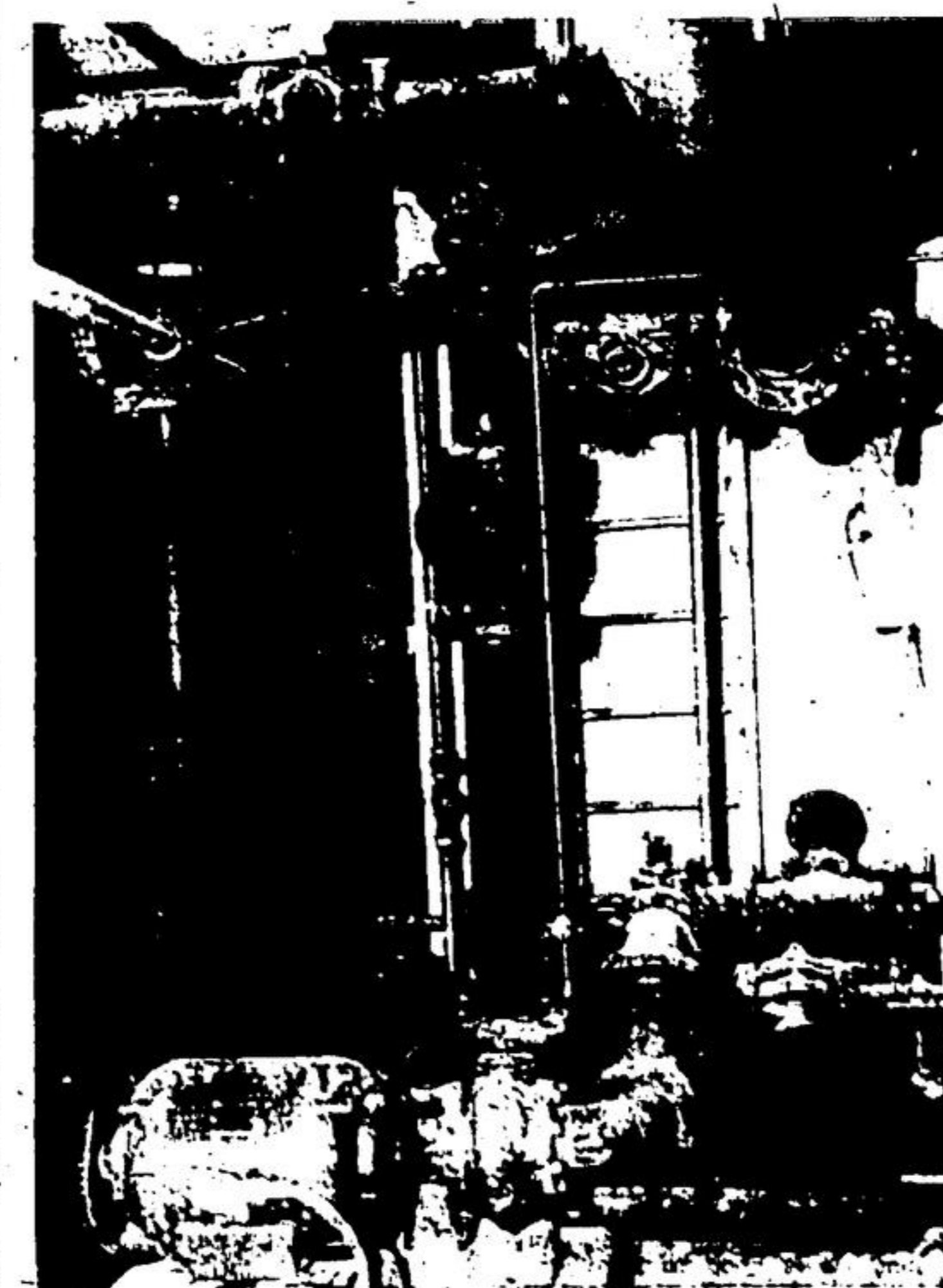
PART OF THE $433,000 maze of pipes and tanks, pumps and motors is shown here at the disposal plant that went into operation this morning. This is only one of the corners of the main control station at the disposal plant site on the third line. Trying to trace the pipes and their function is an involved job. Waterworks Supervisor J. Lambert will be in charge of the system when the town takes it over.