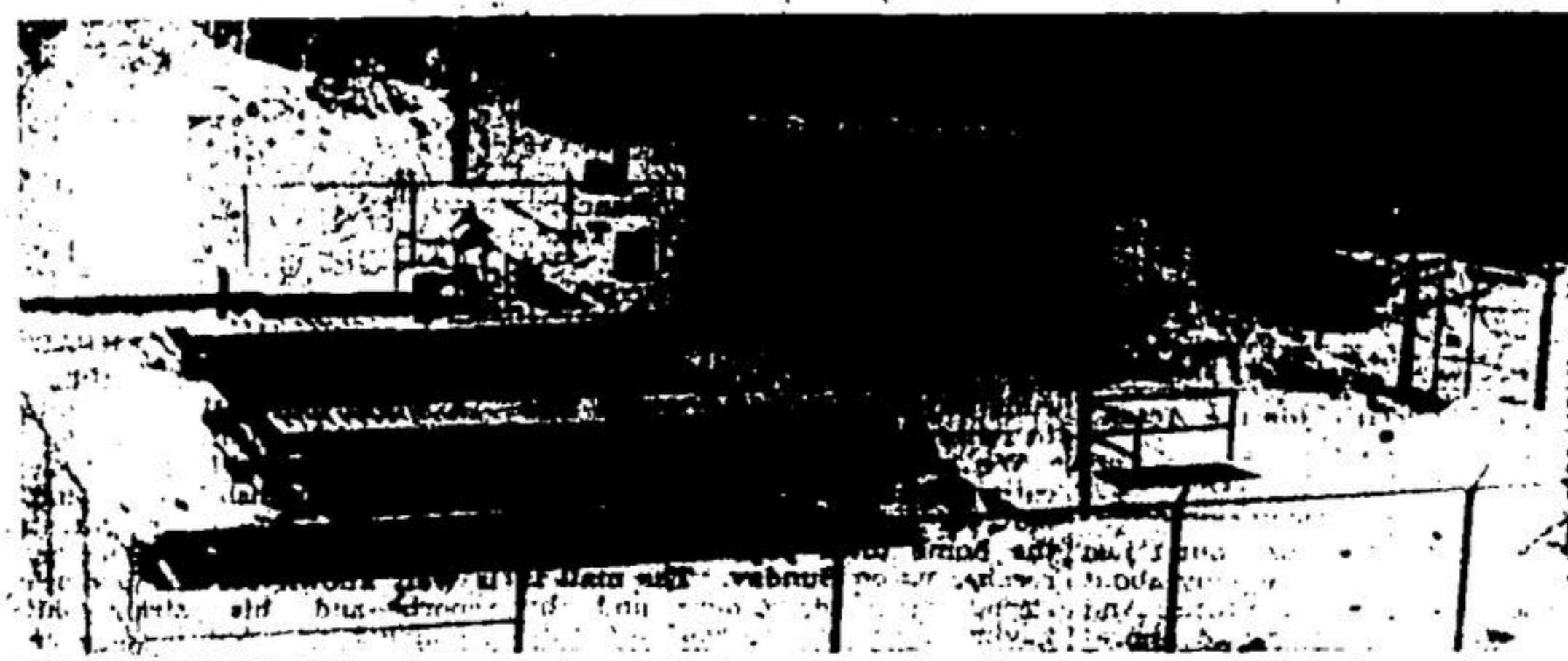
OVERALL VIEW of the disposal plant includes all but the digester tank which is located on a nearby hill. Work on the actual operation of the plant was completed and the system was put into action today. Seen here in January, the actual appearance of the plant has not been changed much. Engineers and workmen have been busy this week, and particularly Wednesday, testing and checking the process. —Staff Photo

ACTON, ONT. MAIN STREET N. Phone days 464, nights 341W or 119J12