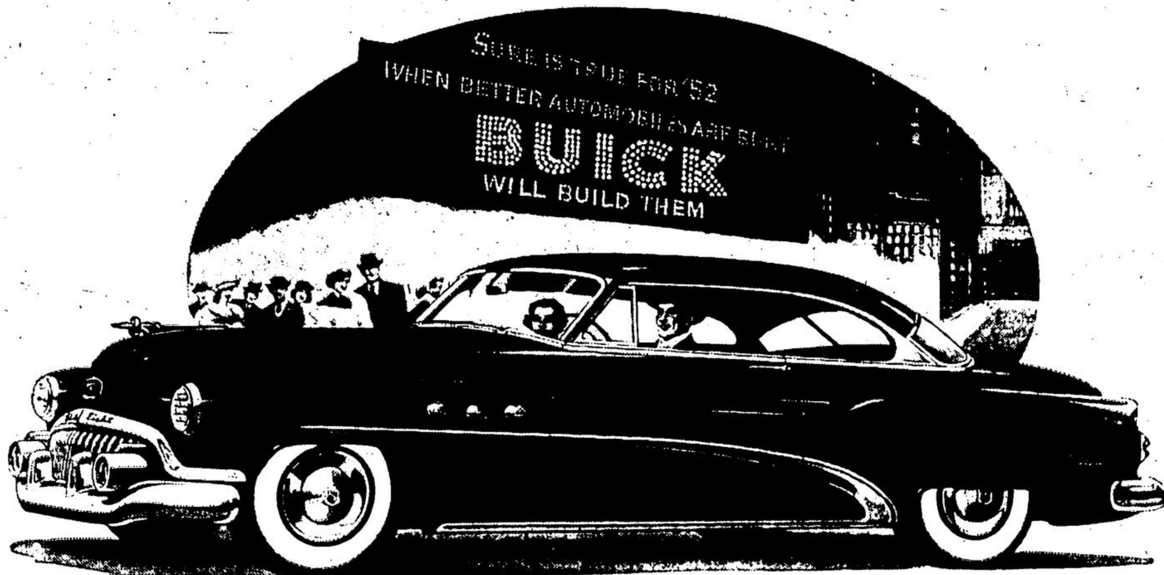
A GENERAL MOTORS VALUE