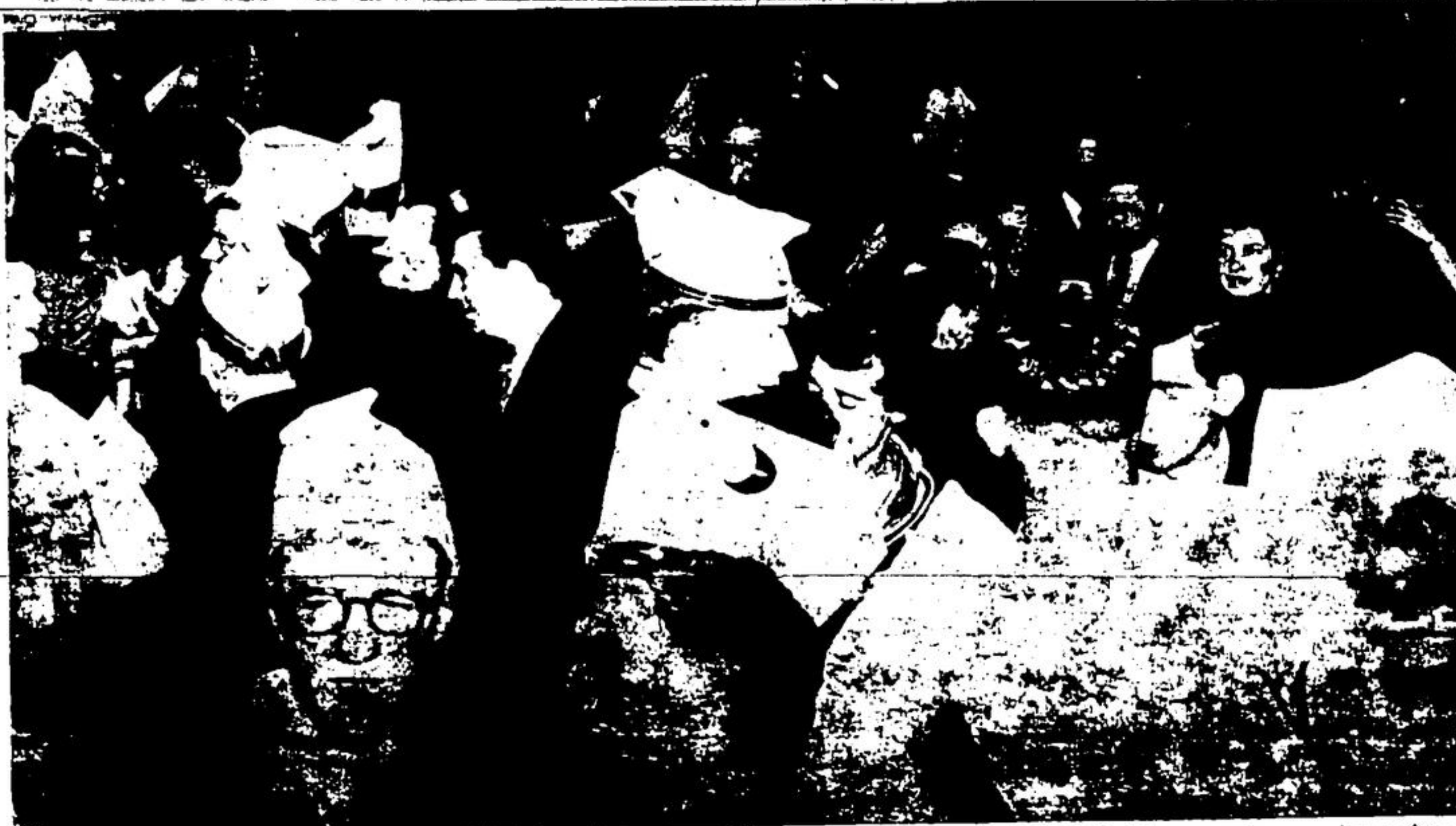
OH YES, IT WAS CROWDED on the dance floor of the old Town Hall last New Year's eve when the celebration was broadcast to all of Canada on the trans-Canada network of the CBC. Ardent dancers claimed it was impossible to manipulate the intricate steps but

enjoyed getting pushed around. The crowd scene shown here will give broadcast listeners some idea of the packed atmosphere of the dance floor. It is possible to identify many local faces if you look closely at the picture.