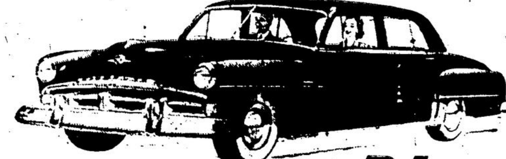
THE CRANBROOK FOUR-DOOR SEDAN With Standard Type Extra Equipment