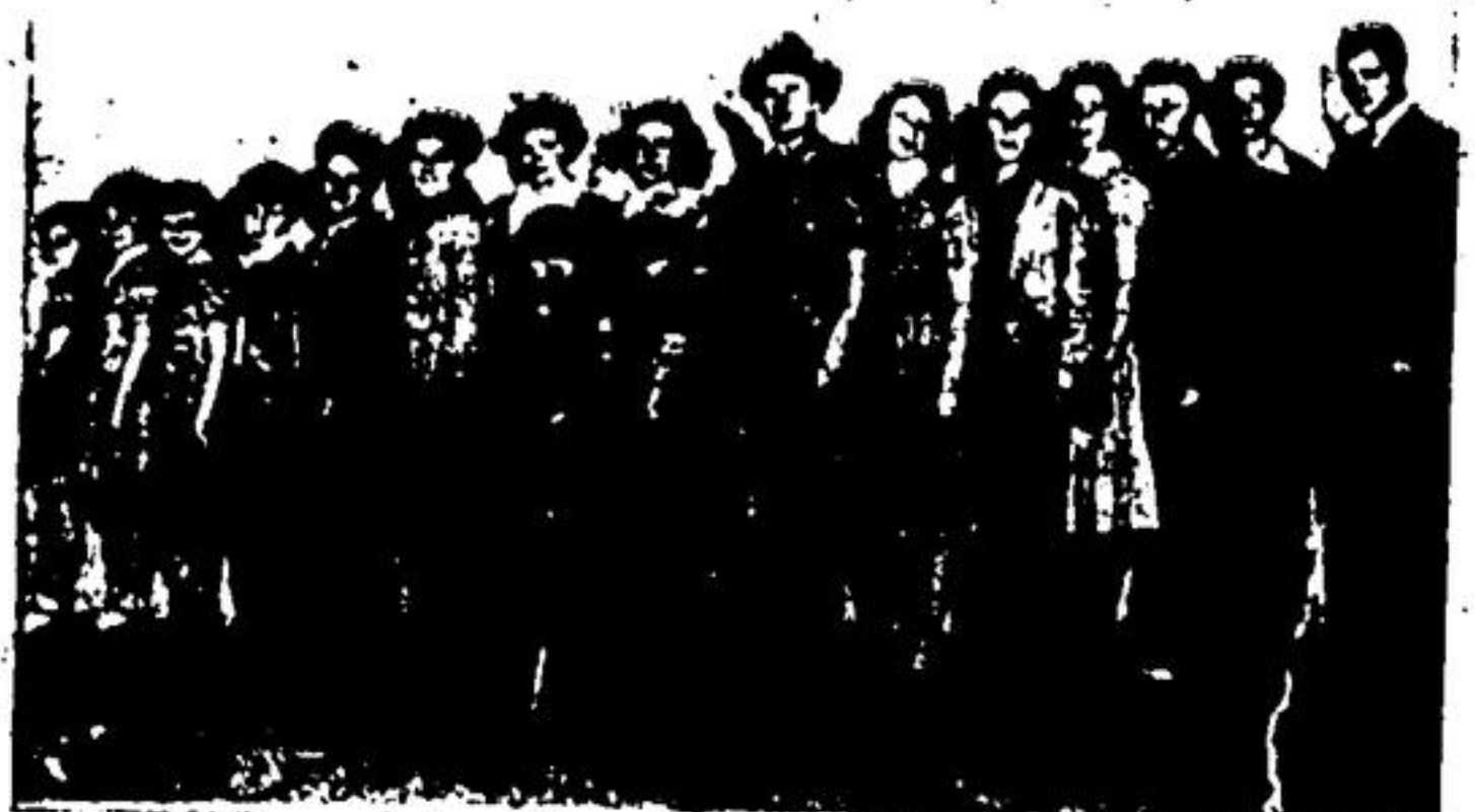
"MA AND PA KETTLE Back on the Farm" starring Marjorie Main and Percy Kilbride in the laugh hit of the year will be shown at the Roxy, Acton, Monday through Thursday next week.