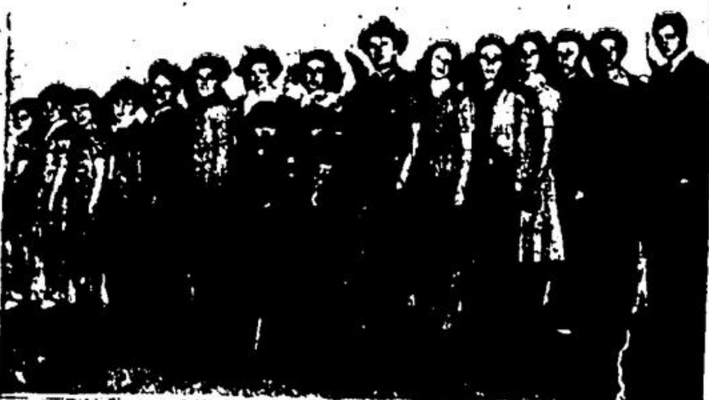
"MA AND PA KETTLE Back on the Farm" starring Marjorie Main and Percy Kilbride in the laugh hit of the year will be shown at the Roxy, Acton, Monday through Thursday next week.