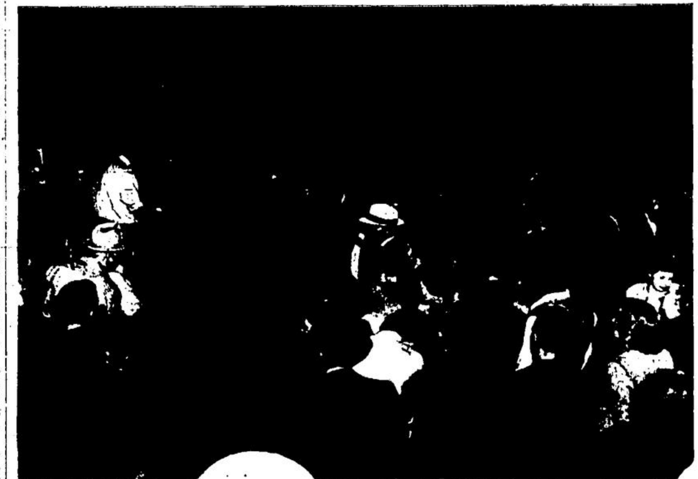
ABOUT 1,000 ITEMS were sold at the Community Auction held in the Acton Arena last Saturday under the sponsorship of Acton Y's Men's Club. Items collected from Acton homes crossed the auction block in a seemingly endless procession. Hindley and Elliott handled the auctioneering and crowds gathered to search for bargains in anything from clothes to beds. This is a typical scene as the crowd listens to bidders and auctioneers in their familiar line of patter.

It is expected the operation will be completed soon.