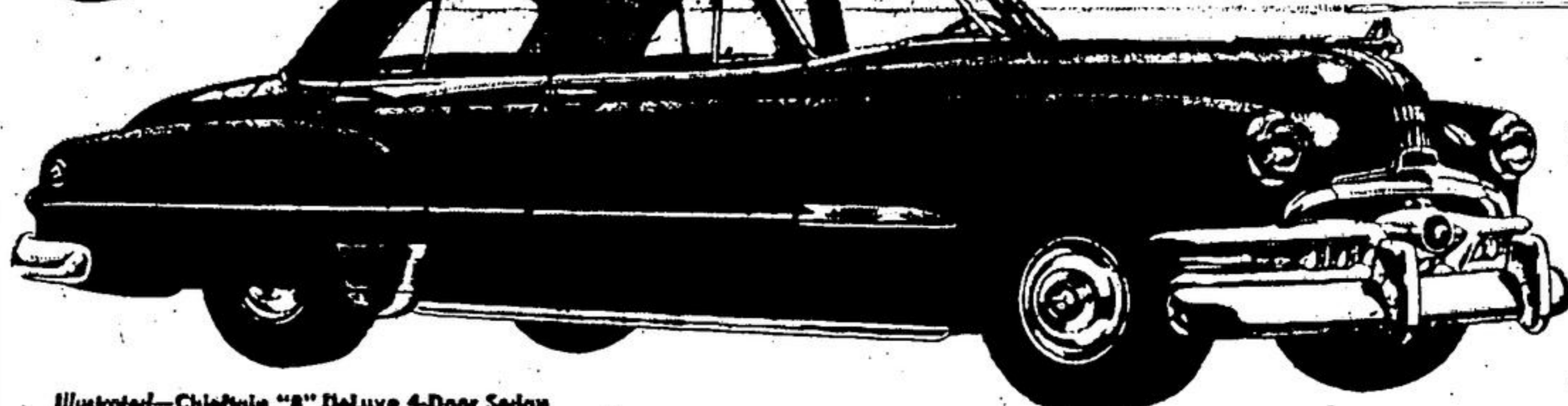
Illustrated—Chiefair "8" Deluxe 4-Door Sedan