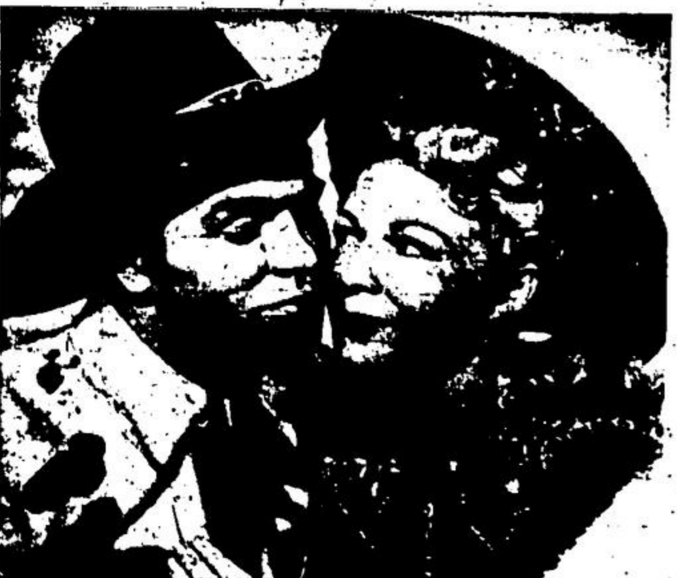
VIVACIOUS BETTY HUTTON and handsome screen newcomer, Howard Keel, are the singing and romancing stars of "Annie Get Your Gun".