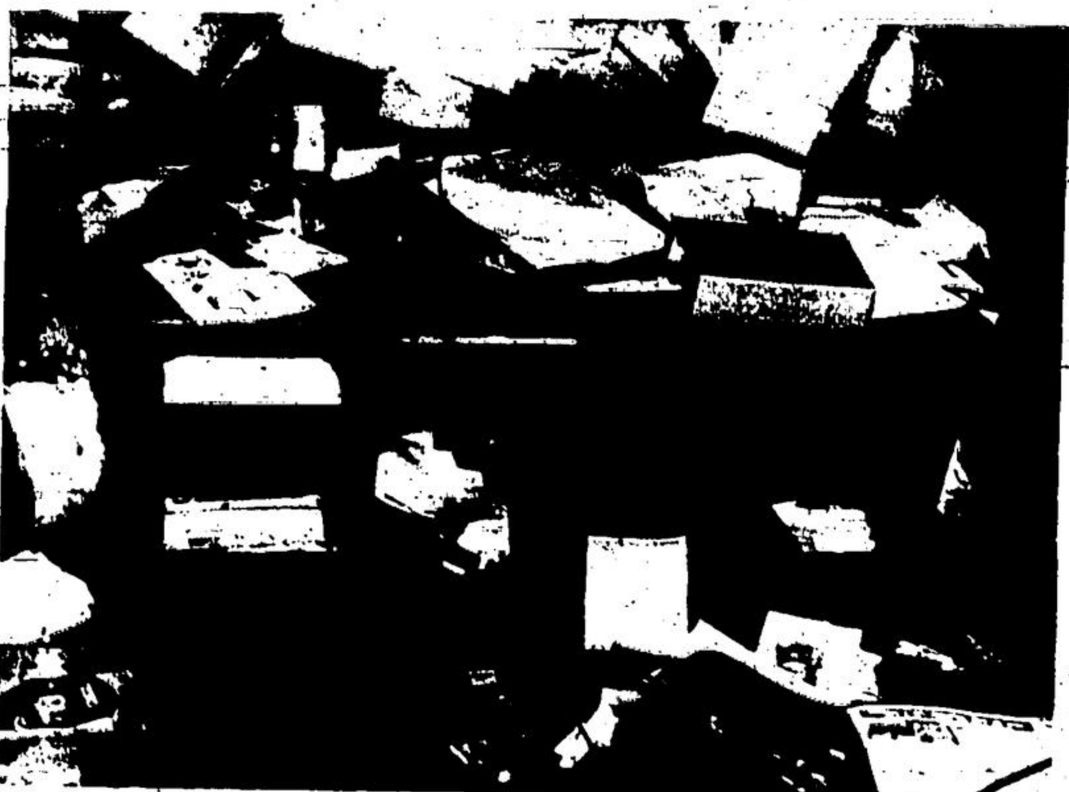
VANDALS RANSACKED the office of Ajax Engineering in August and strewed papers and material around. They entered from a window obscured from the road by a pile of lumber. A fountain pen and some stamps was all that was stolen. The firm offered a reward for information in connection with the break-in.