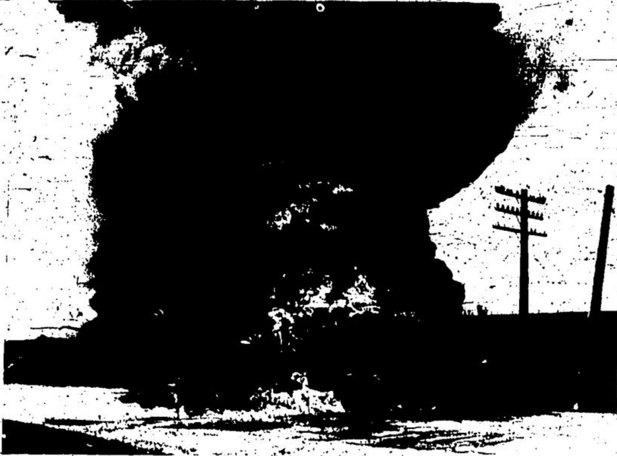
A-BLAZING INFERNO , this truck caught fire at Crewson's Corners and was flagged down by a passing motorist in May. Attempts of the driver, Stan Tilley, Toronto, to extinguish the blaze, were hopeless and 80 gallons of gasoline exploded as a result of the flames.