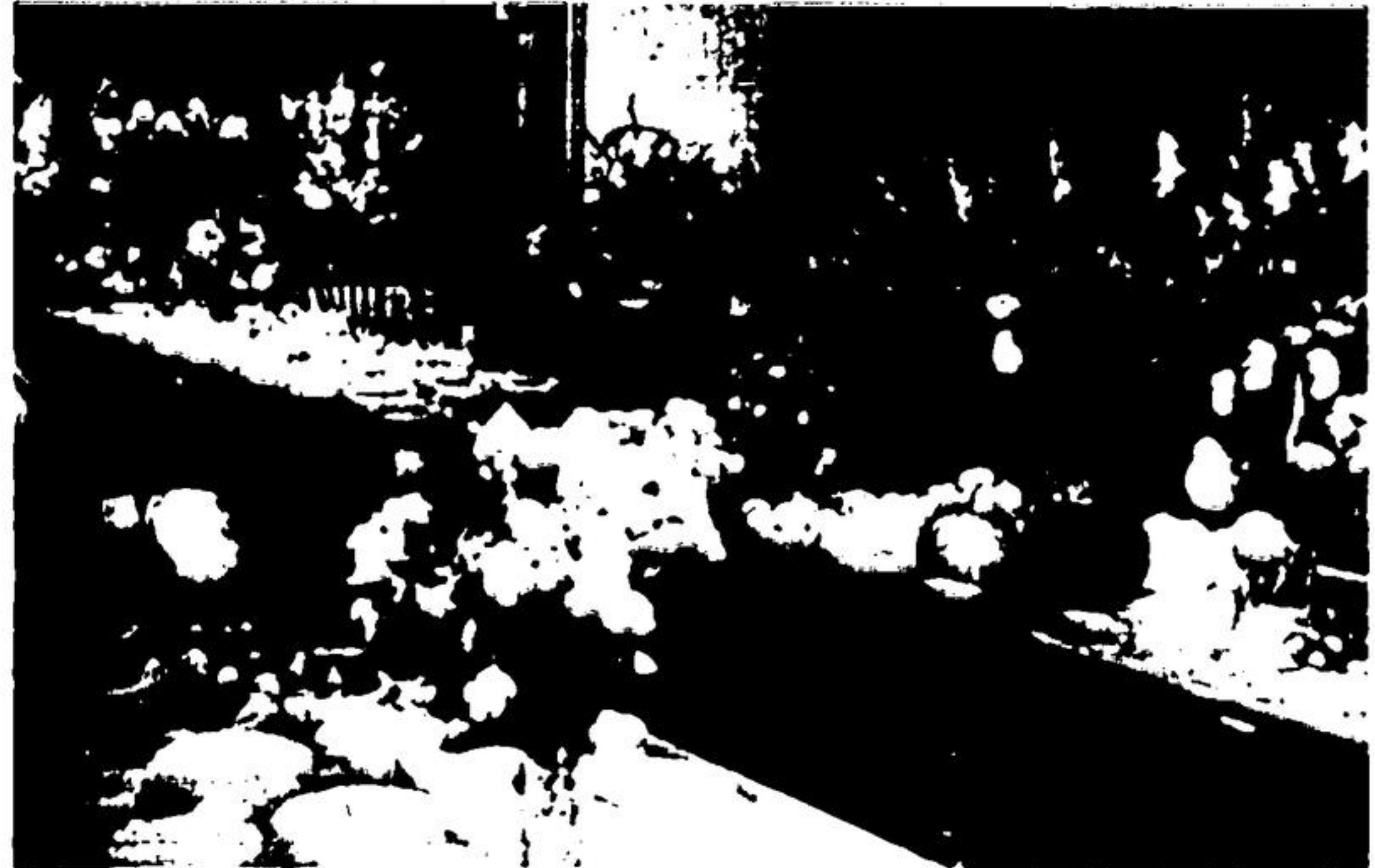
COLORFUL ARRAYS of flowers predominated at the annual Rockwood Horticultural Show staged in the Rockwood Community Hall, in August. Over 276 entries were made in the vegetable and floral classes and a large number of people were attracted by the fine exhibition.

Pictures on this page have appeared in the 1950 editions of your home town paper. They are again presented here to refresh your memory on the events that have made up the life of the community and district during the past year.