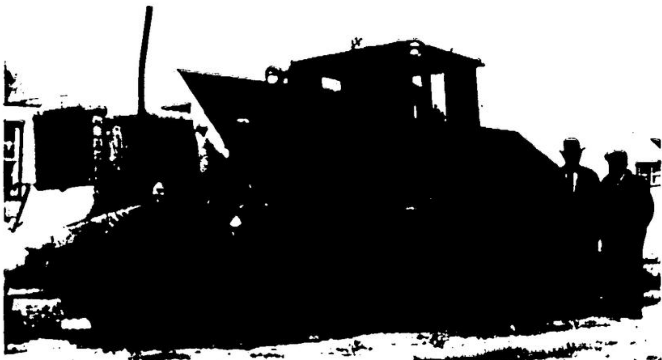
MOTORISTS WERE GLAD to see the new road grader purchased by the town in late April put to work on Acton streets. Taken in the Wartime House on subdivision this picture shows the number of interested spectators. The new purchase by the town was felt quite advantageous and worked throughout the summer months straightening on streets around town.