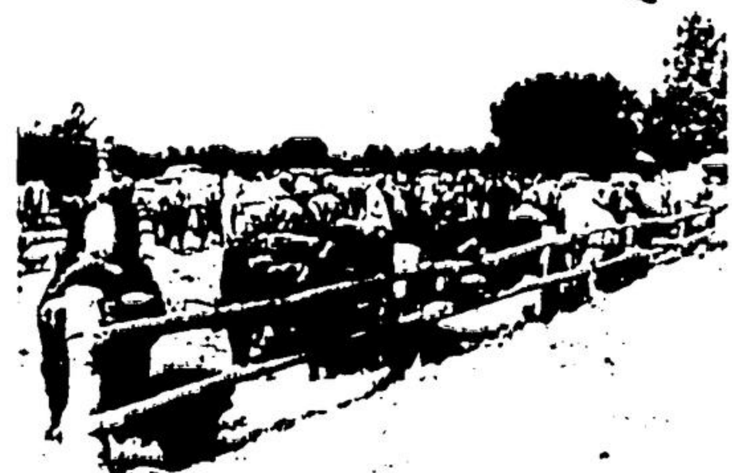
MANY WELL-BRED CATTLE were displayed at the fair, as samples of the fine herds in the district. Poultry, hogs, sheep and pets were entered in class competitions as well as various breeds of cattle.