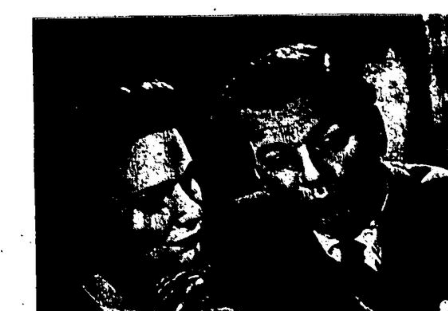
LOVELY VALLI playing the most unusual role of her career as a Vienna actress loyal to her murder-acquainted sweetheart, faces a romantic dilemma with Joseph Cotten in "The Third Man" coming to the Roxy, Acton, next Monday and Tuesday.