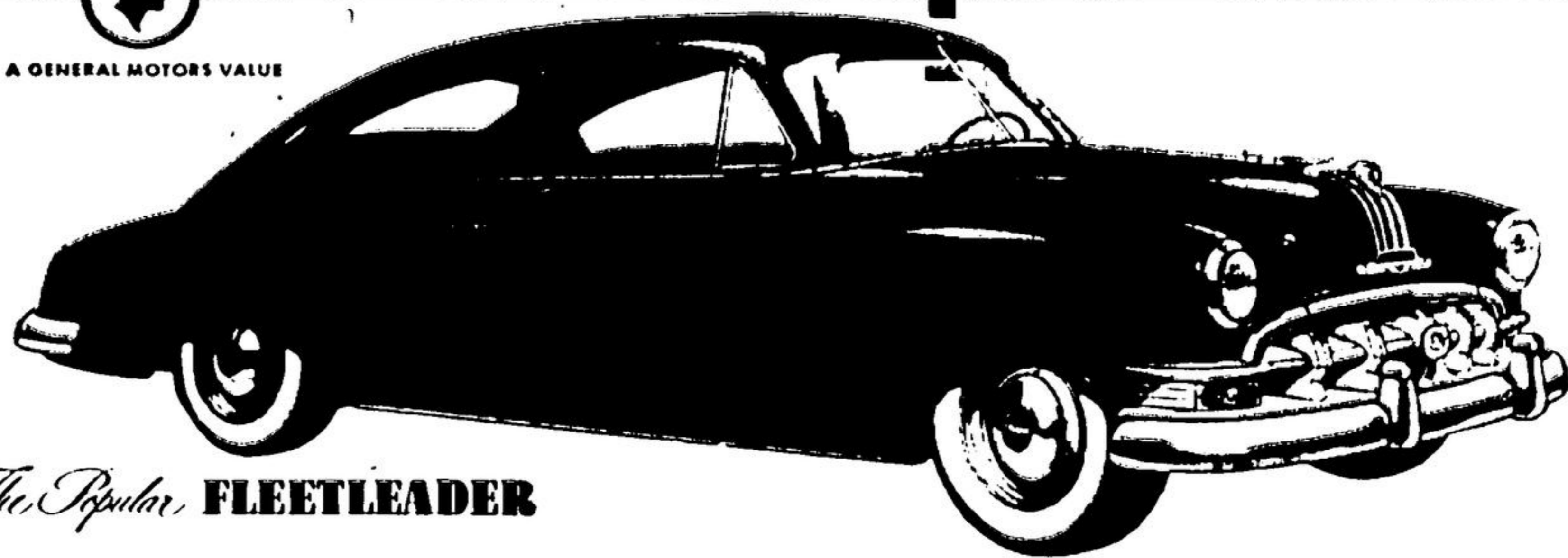
The Popular FLEETLEADER

Take a long look at this big, six-passenger Fleetleader Special, with Pontiac's exclusive Silver-Streak Styling and powered by the famous Pontiac 6-cylinder L-Head engine. Then, get the price from your Pontiac dealer. Take a long, long look at that price! Yes, the car that's way up in value and way down in price is that feature-packed Pontiac Fleetleader Special. And for only a few dollars more, the Fleetleader DeLuxe gives even more beauty, convenience and comfort. See them both!