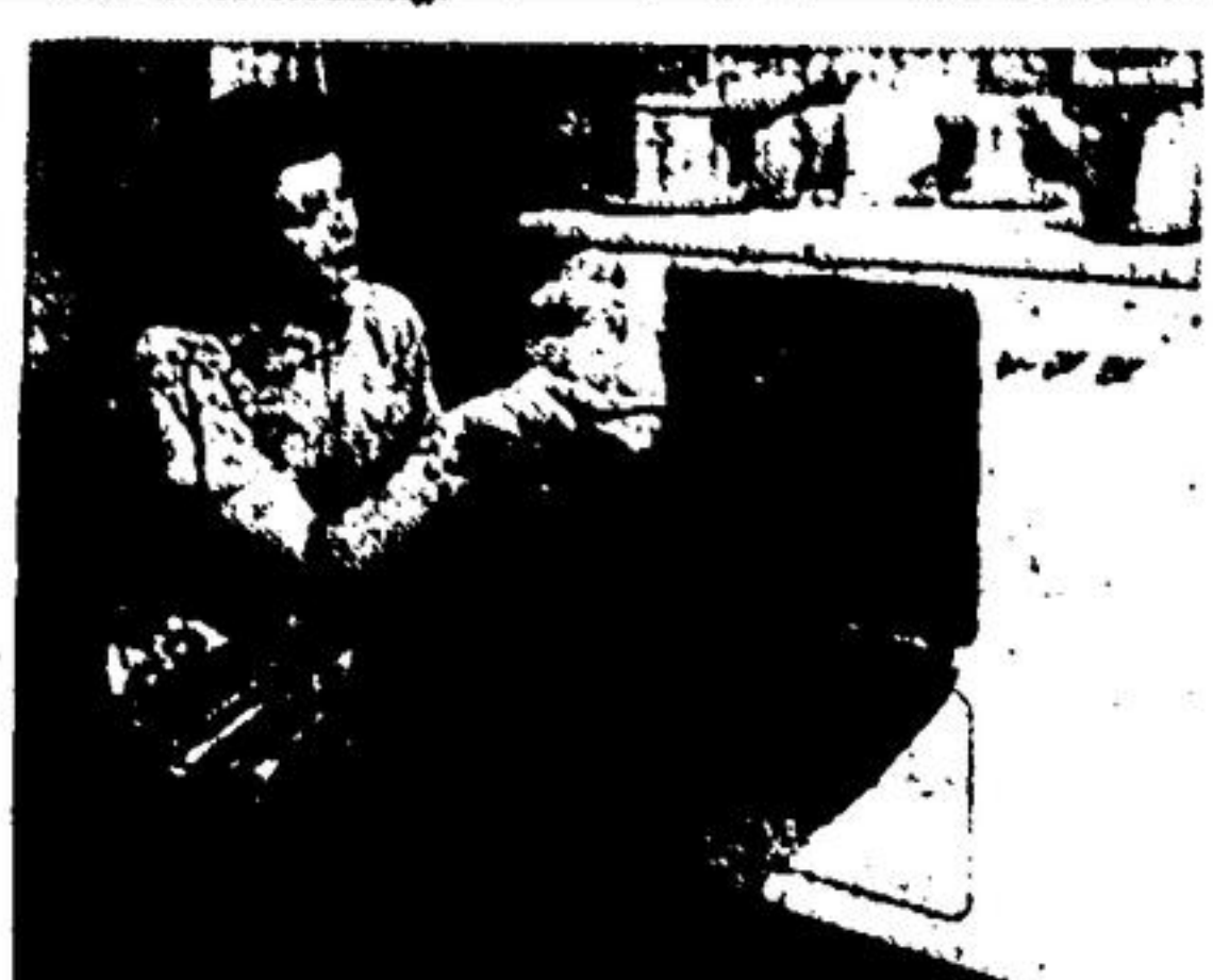
5 Big enough to hold a turkey gobbler with ease, the oven has accurate temperature control for better baking results and perfect roasts.