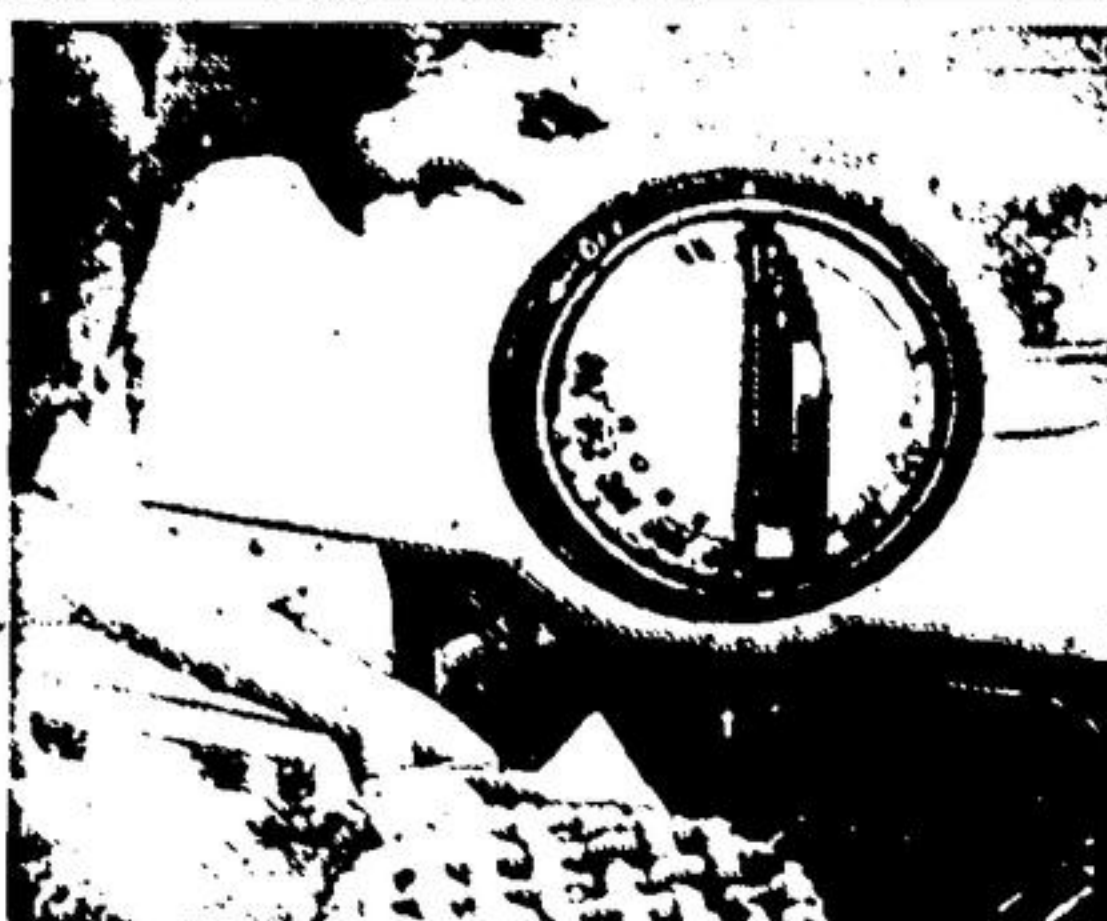
4 Essotane makes cooking a joy—brings new happiness into your home in the form of better, more delicious, more wholesome meals for all the family.