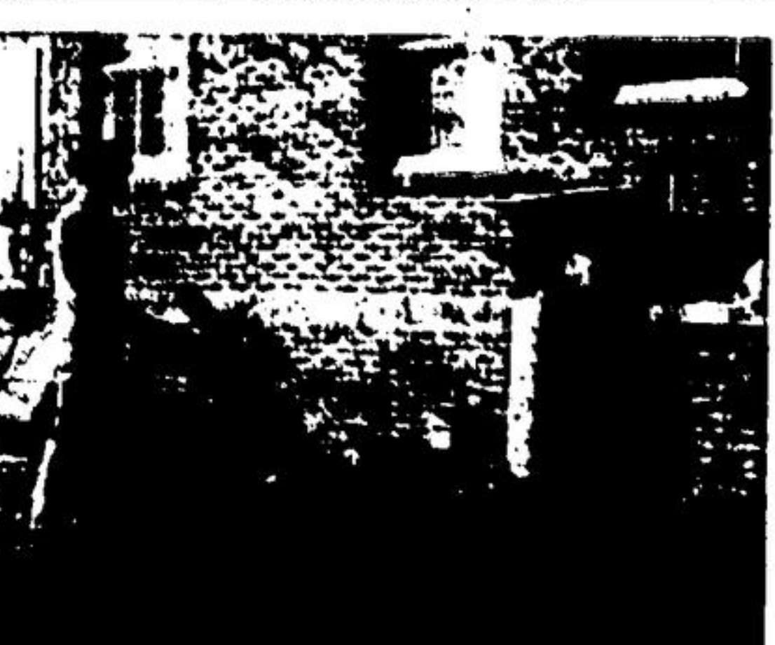
6 Clean, safe Essotane cooking gas is led to your stove by a small copper tube from steel cylinders installed outside your house.

It's easy to start using Essotane. Imperial Oil service men simply set up the tidy cylinders and connect them with your beautiful, Essotane range. For the average family one cylinder will last up to three months. The cost is small. Essotane is the same type of product now being enjoyed by more than 4,000,000 homes in Britain and the United States. Get the facts. Send the coupon today.