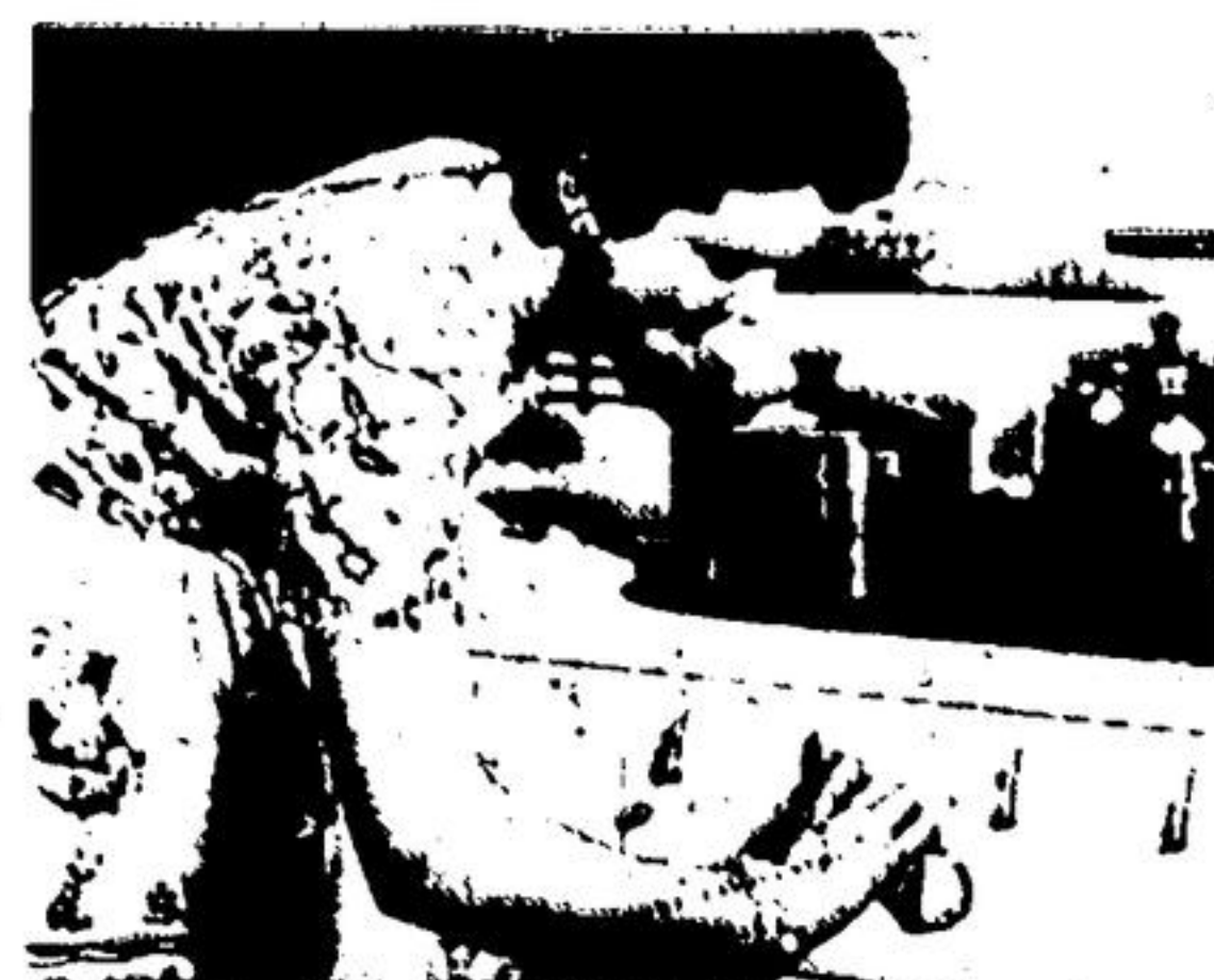
2 The convenience, speed and cleanliness of Essotane means extra leisure time for you. No fussing with coal or wood fires. Faster cooking. Less cleaning.