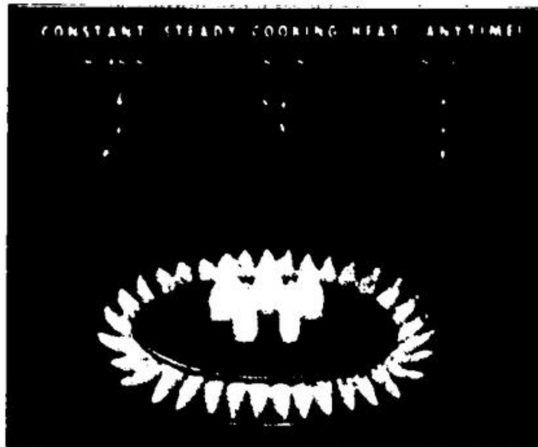
1 Automatically, at the touch of a valve, the burner lights. You get a hot, clean, odorless flame instantly. No smoke or soot.

Turn Cooking from a Tiresome Duty into a Real Pleasure