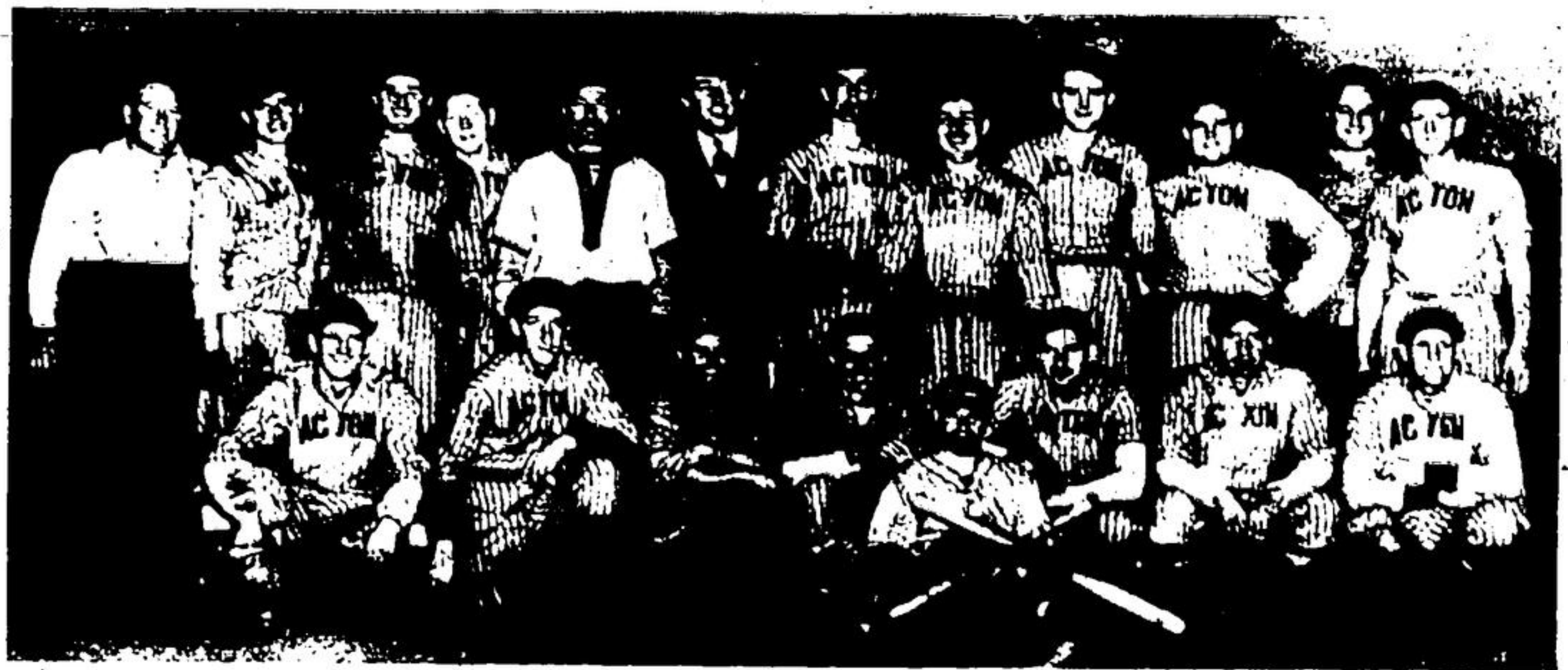
O. B. A. Intermediate B Baseball Champions 1947 after the Delhi Game