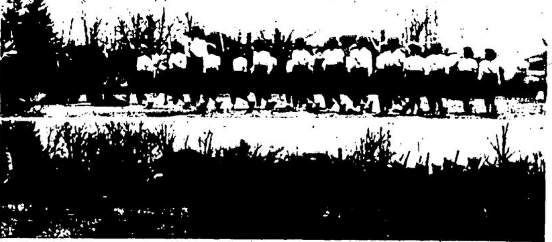
Cadet Inspection in Acton Park Last Year