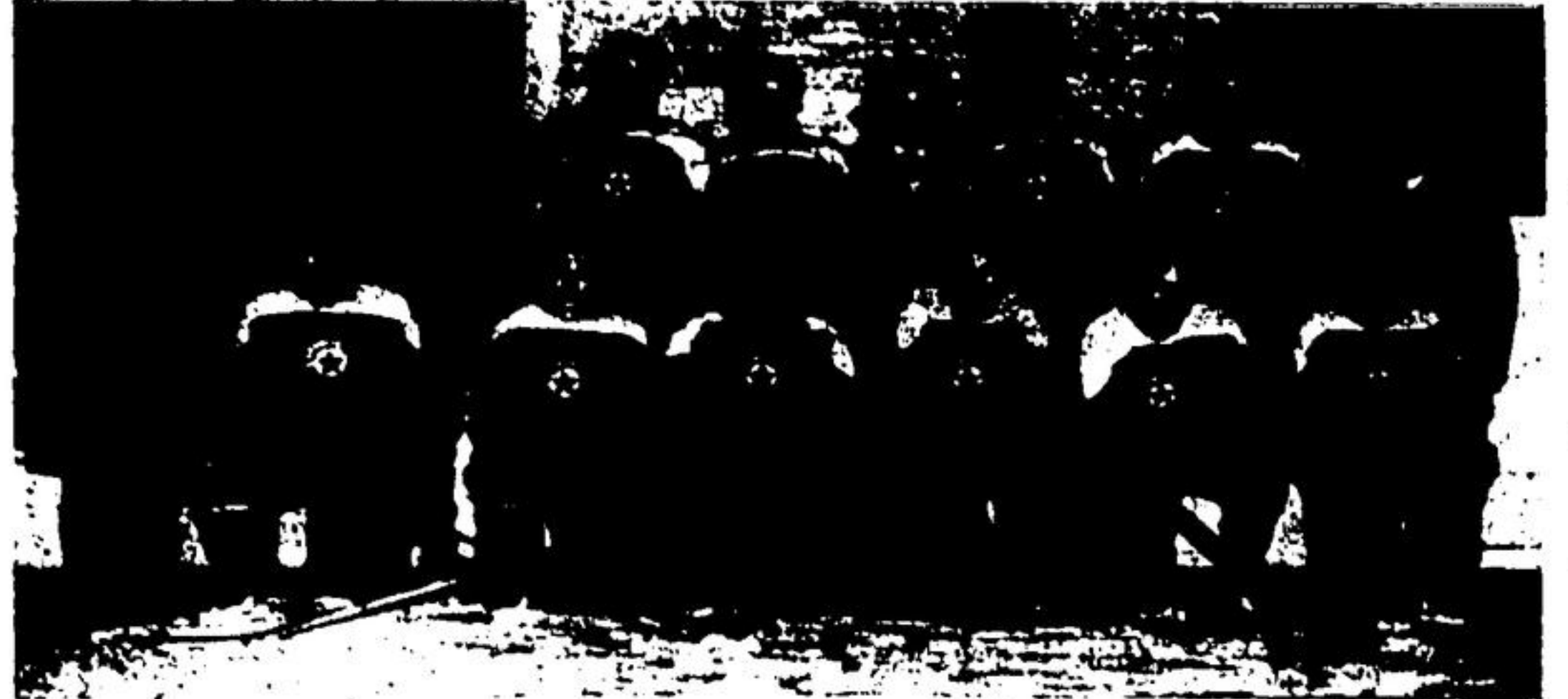
Last Year's Semi-Finalist Intermediate Hockey Team