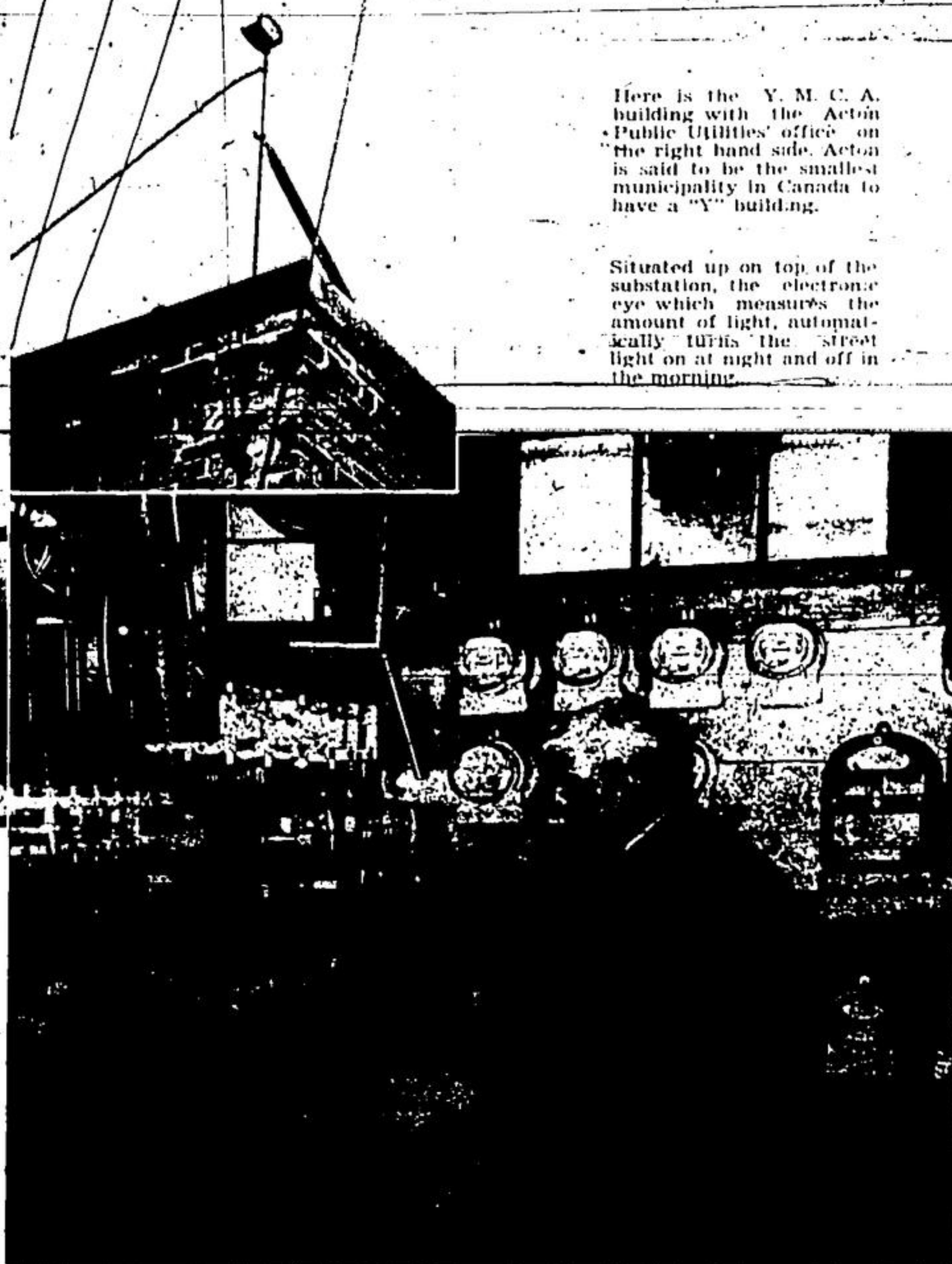
Situated up on top of the substation, the electronic eye which measures the amount of light, automatically turns the street light on at night and off in the morning.