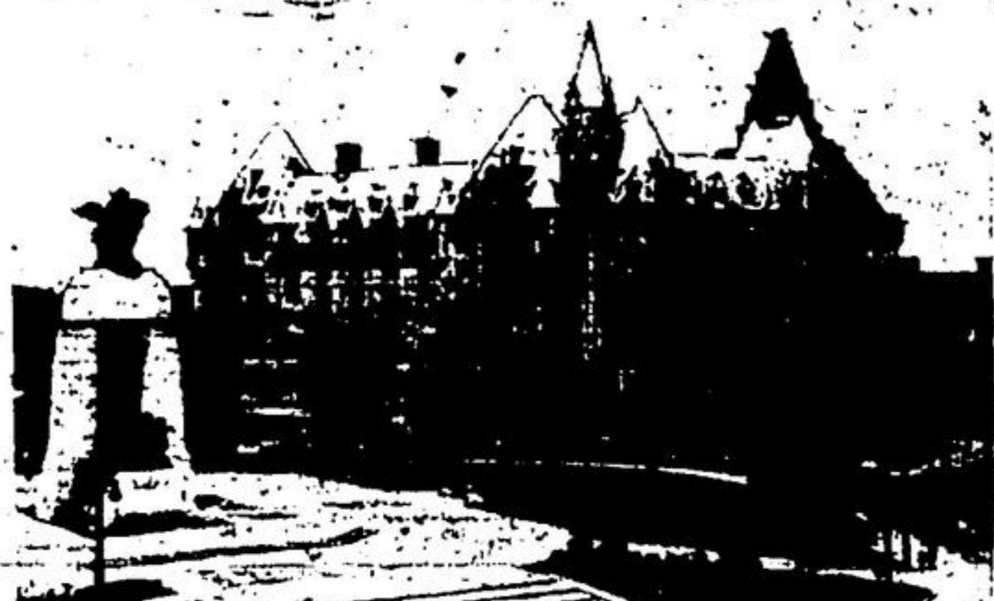
Headquarters for the annual meeting of the Ontario-Quebec division Canadian Weekly Newspapers Association is the Chateau Laurier, famous Canadian National hotel at Ottawa.