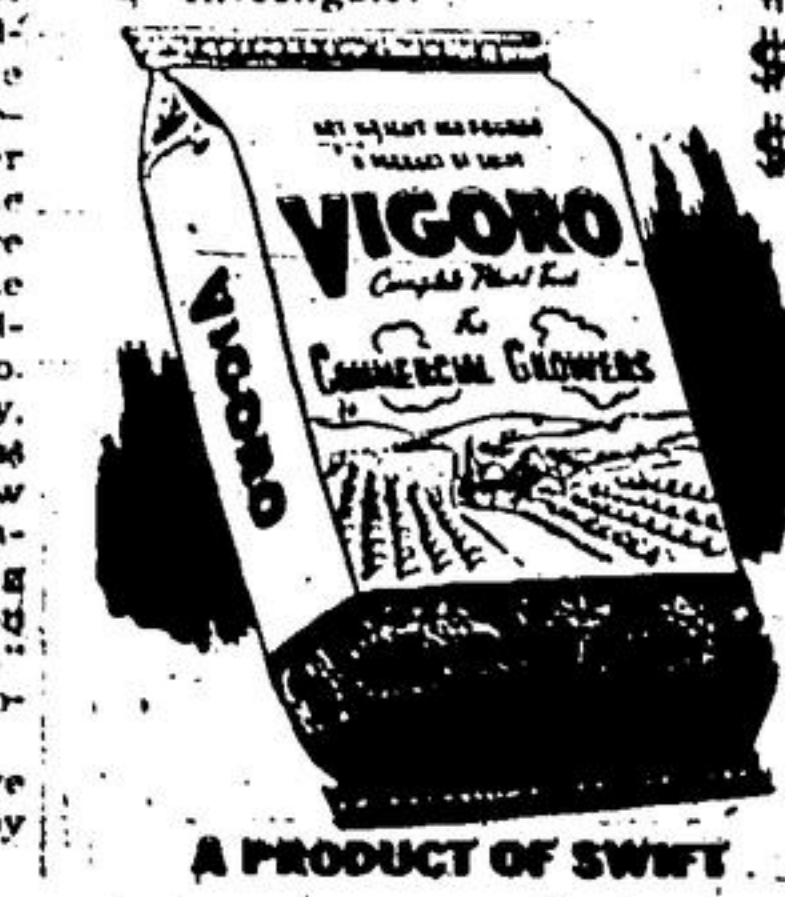
A PRODUCT OF SWIFT

Experience is proving that pays the grower well to feed strawberries with Vigoro Commercial Grower. Increased yield, early maturity, full flavor, and excellent shipping quality are a few of the advantages many growers are attributing to Vigoro Commercial Grower. These are advantages that spell EXTRA profit. Investigate!