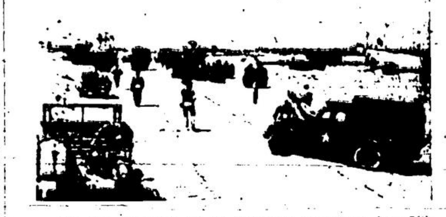
The seas were calm off the Normandy beaches on June 24th and unloading from various craft was in full swing. With the front established the process of unloading magnificent equipment goes on apace.

Photo shows activity on the beaches as the vehicles are driven from the landing craft (tank) on to the beach.