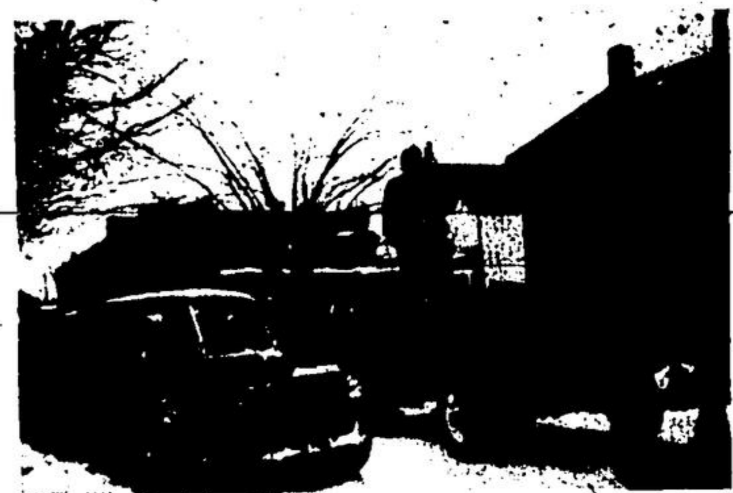
Arrival of Santa Claus at the Christmas Tree and Parade of the Beardmore Employees' Association at Acton Town Hall last Saturday afternoon.