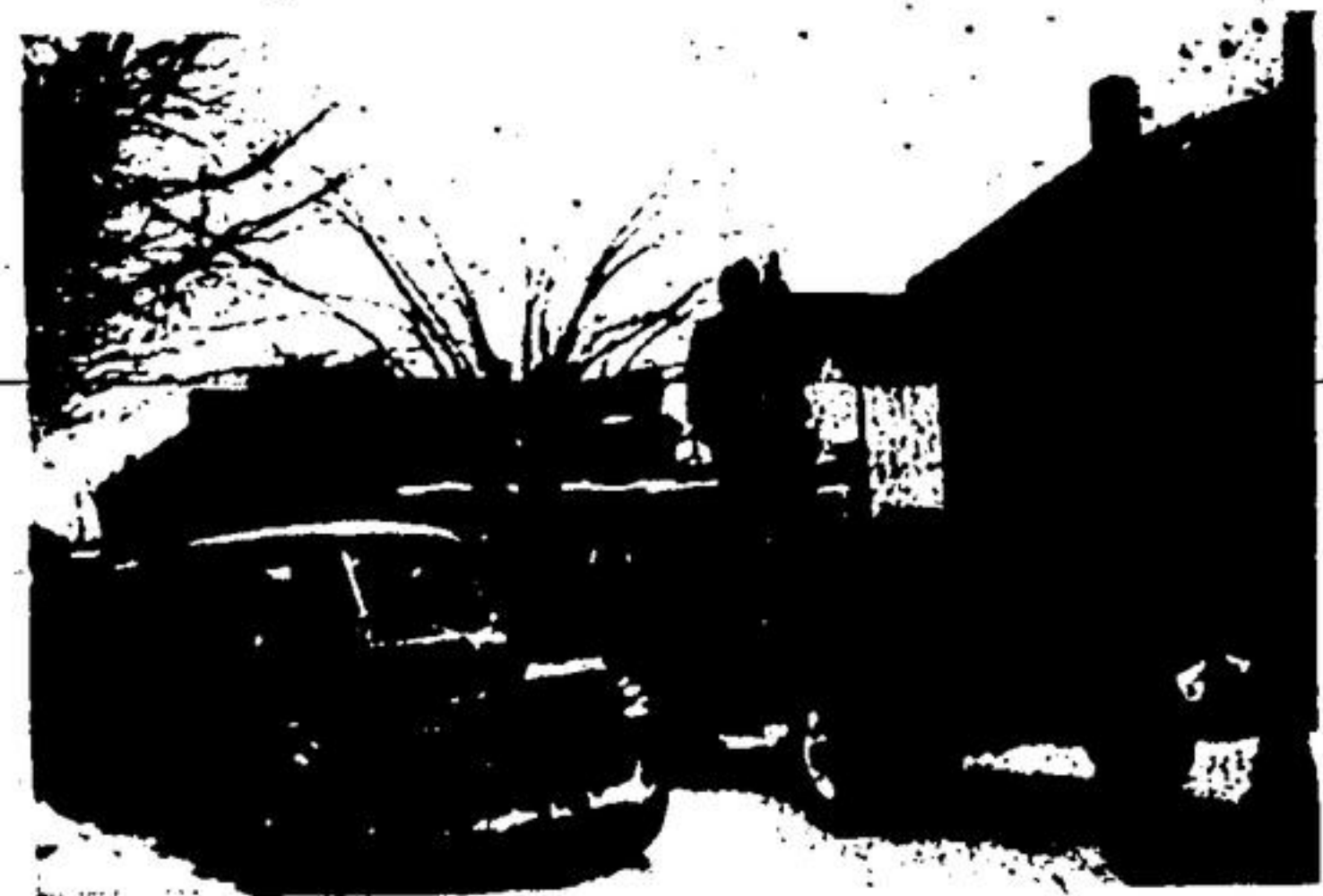
Arrival of Santa Claus at the Christmas Tree and Parade of the Beardmore Employees' Association at Acton Town Hall last Saturday afternoon.