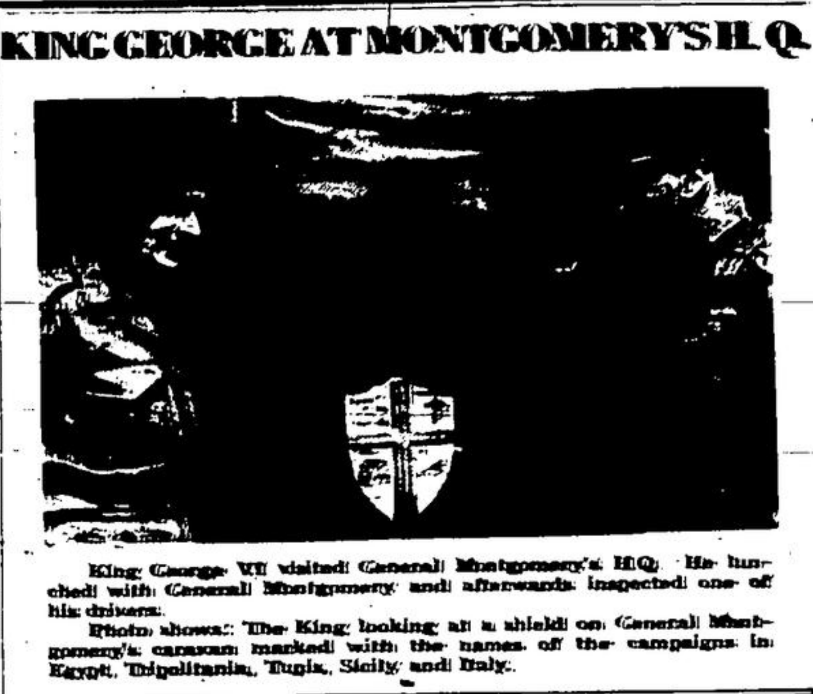
KING GEORGE VI VISITED GENERAL MONTGOMERY'S H.Q.