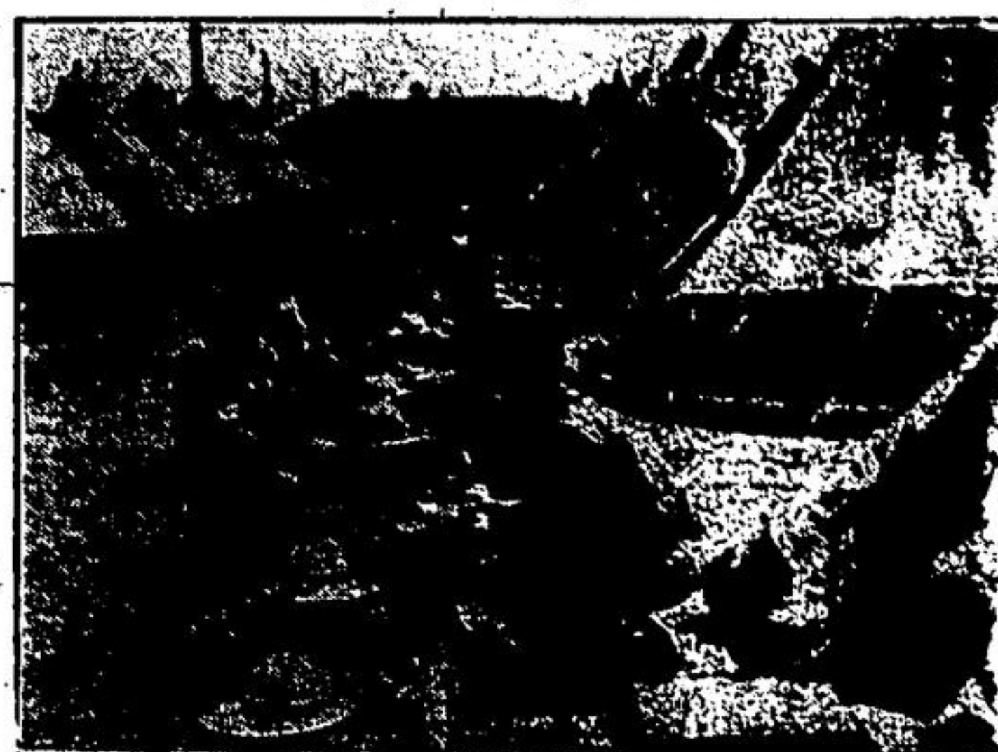
Kits neatly arranged in front of tents where men of the Reserve are comfortably billeted while in camp.