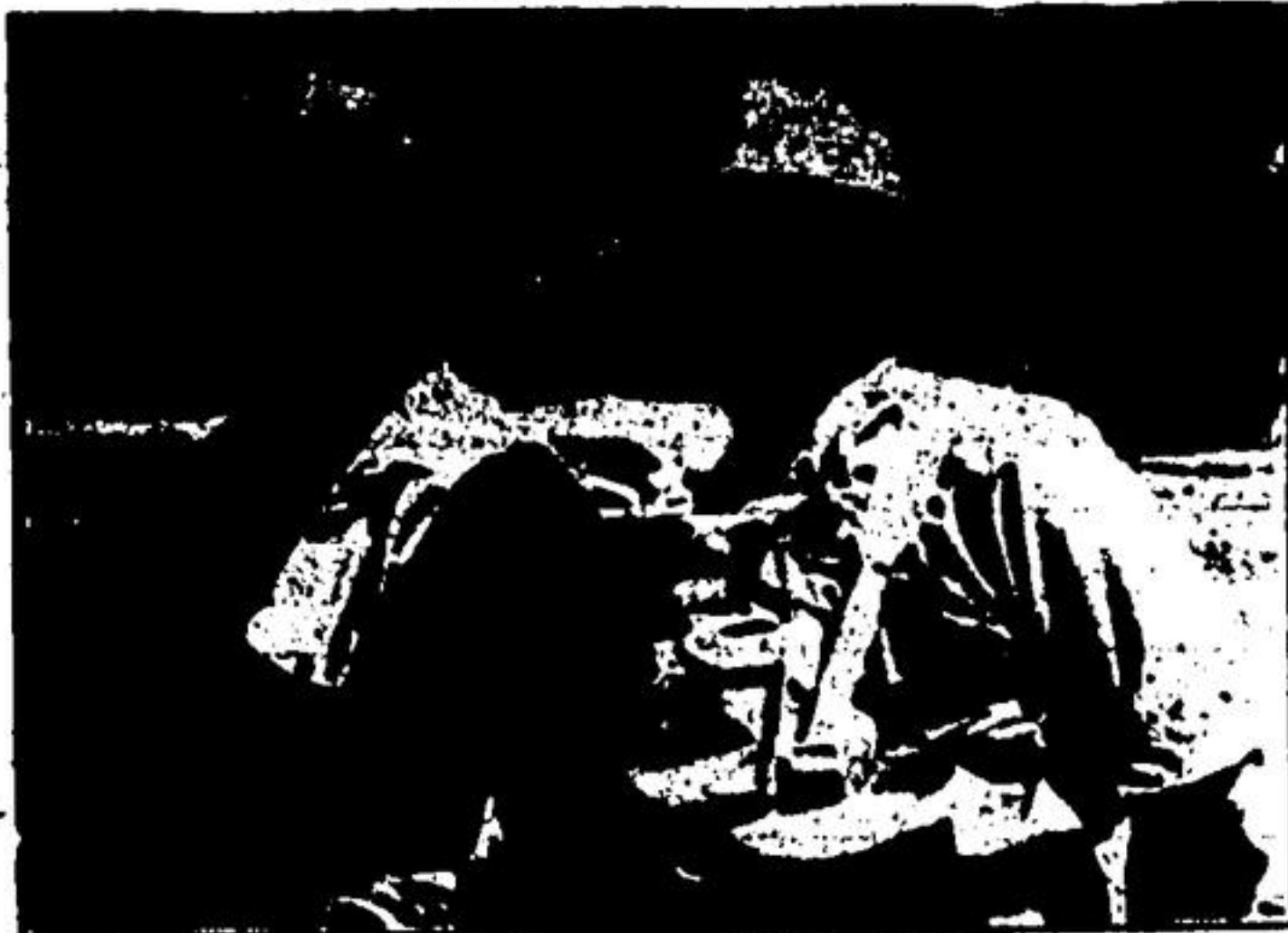
Regimental Sergeant-Major Seal and Sergeant-Major Island watch on while the boys go through their manoeuvres.