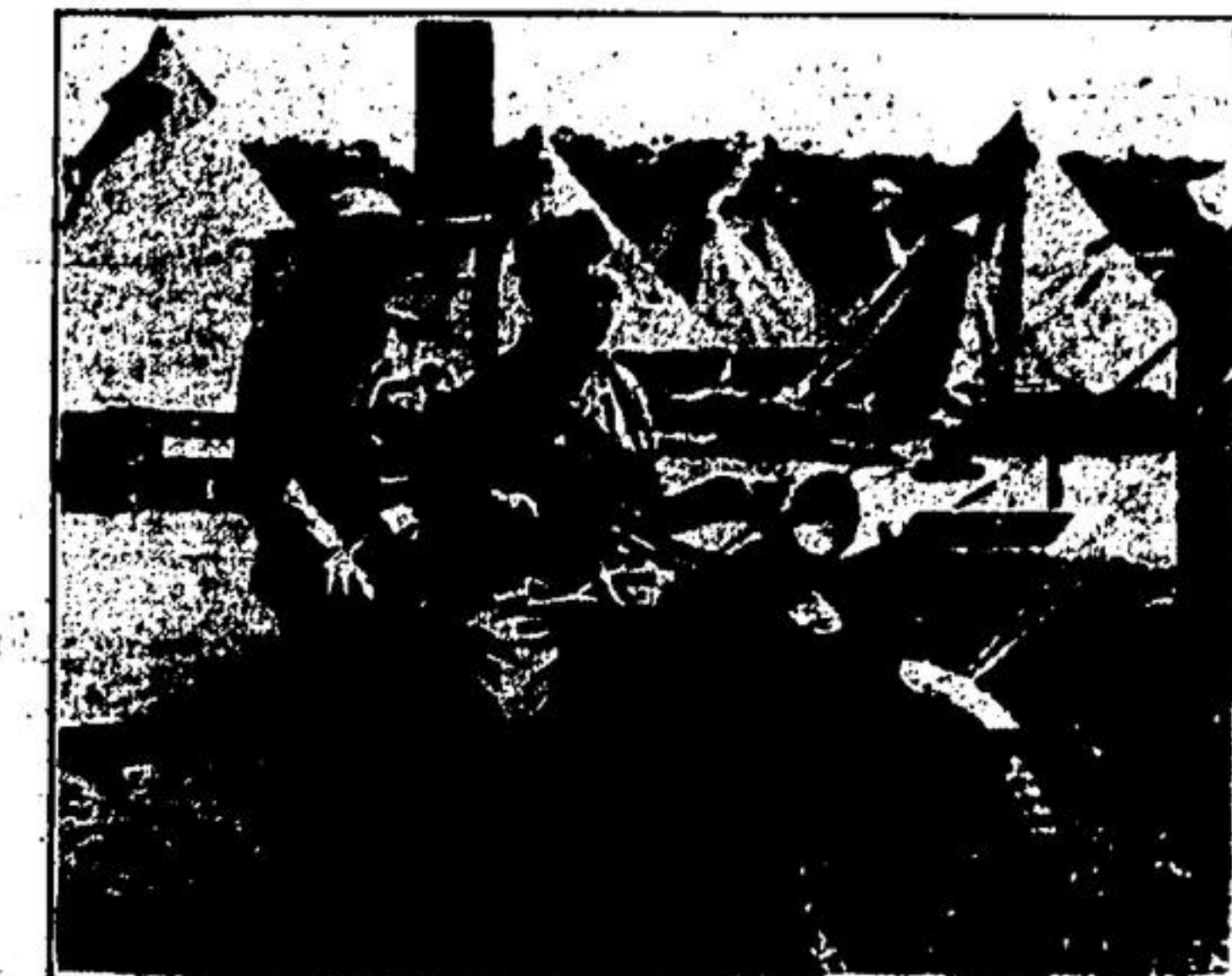
In the Reserve as well in the Active mail plays a big part in the camp interest. Mail is received daily and the men keep in touch with their home ties.