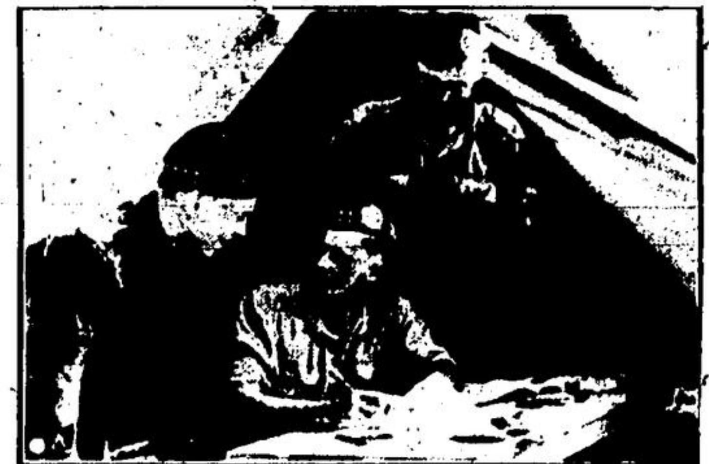
A problem being discussed at company orderly rooms during camp at Niagara-on-the-Lake