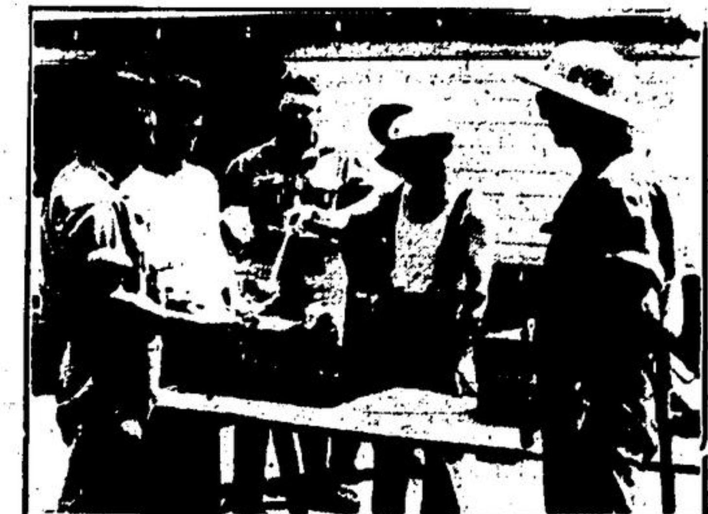
Boys of the Lorne Scots are well fed while at camp. Here the company cook is serving the men.