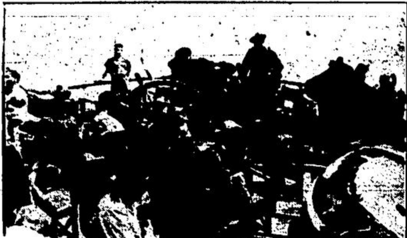
Men of the Lorne Scots Reserve aboard ship on their way to Camp Niagara for two weeks' training. It's a delightful and enjoyable trip.