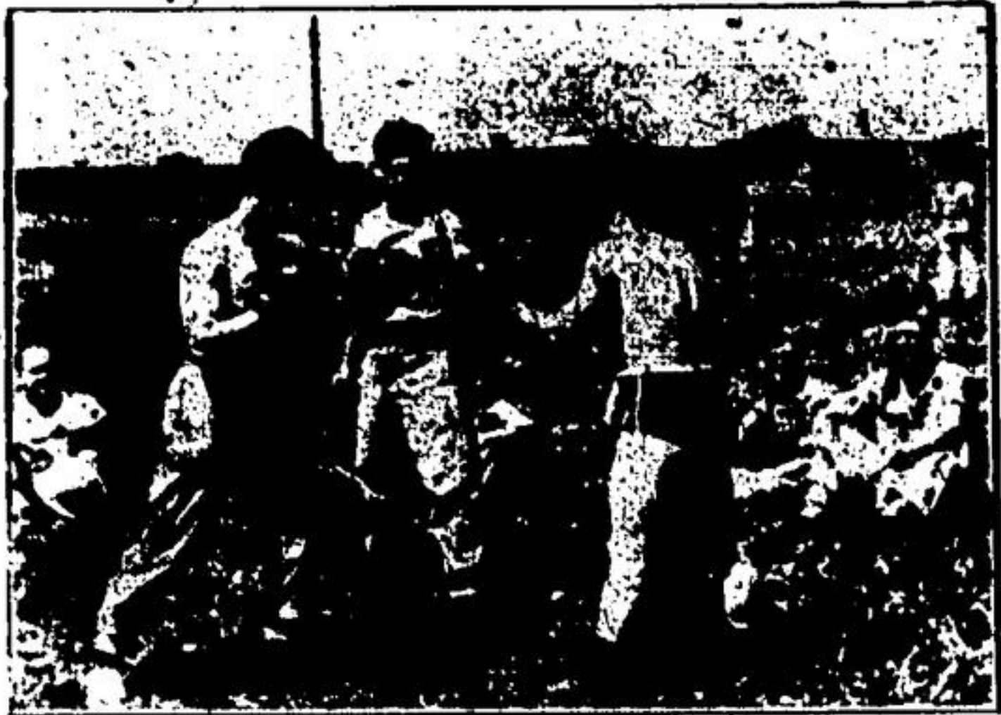
Keenly contested sports are part of the programme while in training at camp.