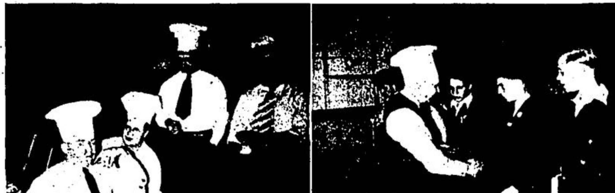
Acton Y's Men's Club Entertain Acton Youth at Banquet and Presentation in Month of May