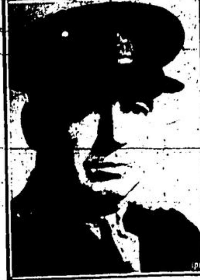
who is in command of the Canadian Armoured Division