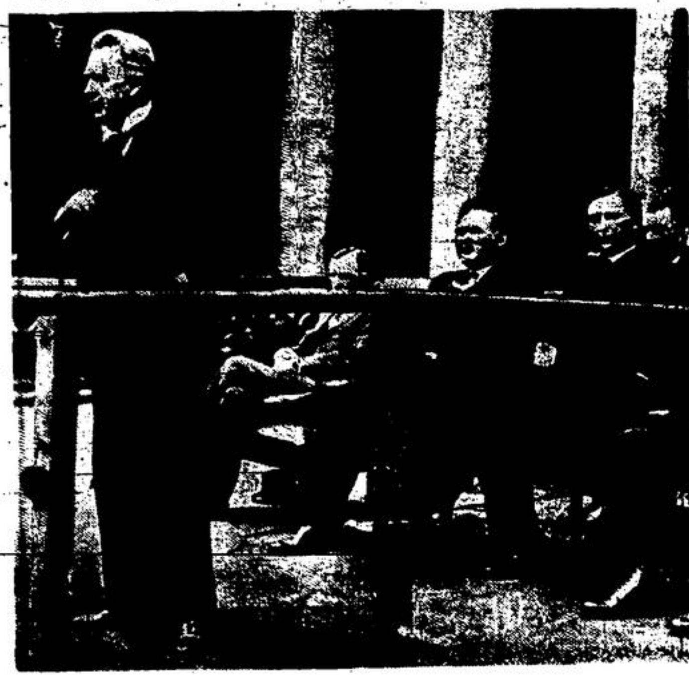
For the first time in 30 years, W. T. Cosgrave and Eamon de Valera, bitter foes of Irish politics, appear on the same platform. Mr. Cosgrave is shown speaking during the great all-party meeting in Dublin. President de Valera warned that Ireland's "hour of peril" may be at hand, hinting that he wanted to invade Ireland so as to have a base within easy striking distance of England.