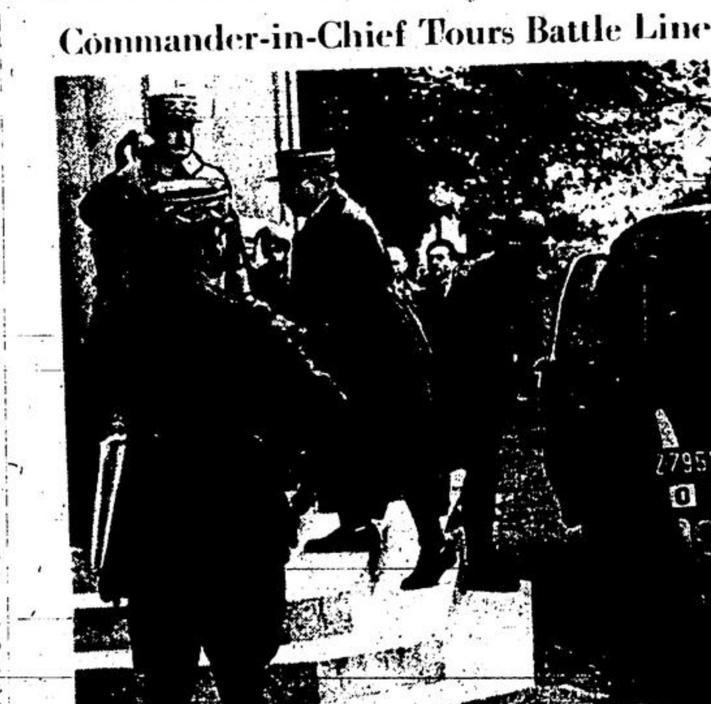
General Gamelin, Supreme Commander of the Allied Expeditionary Force, shown here entering a local staff headquarters, somewhere on the western front, as he toured French positions on the front.