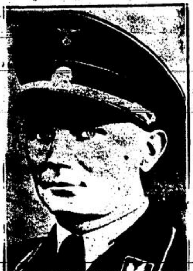
Pictured above is Arthur Greiser, Nazi leader in the free city of Danzig, which belonged to Germany before the Treaty of Versailles. News that Momel had been returned to Germany spread quickly through Danzig.