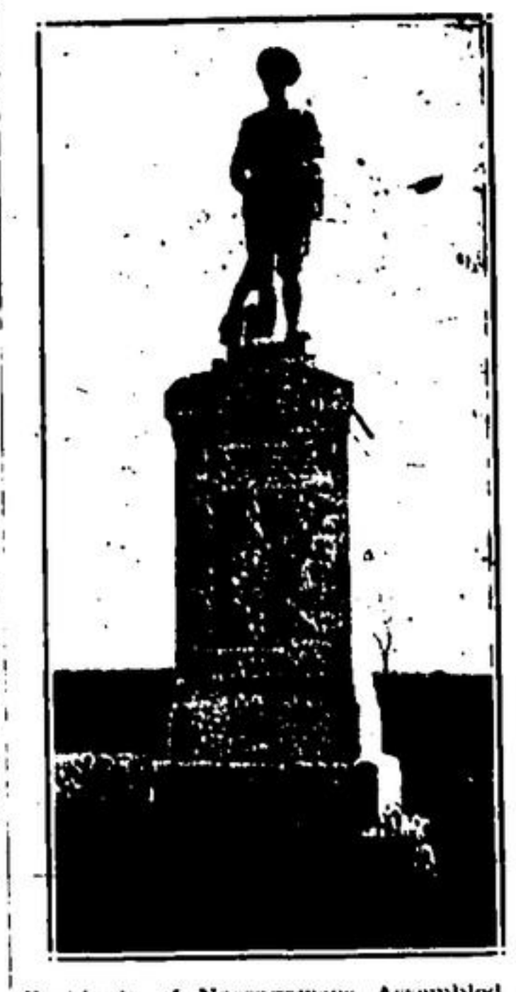
Residents of Nassagwaya Assembled at this Memorial for Remembrance Day Service.