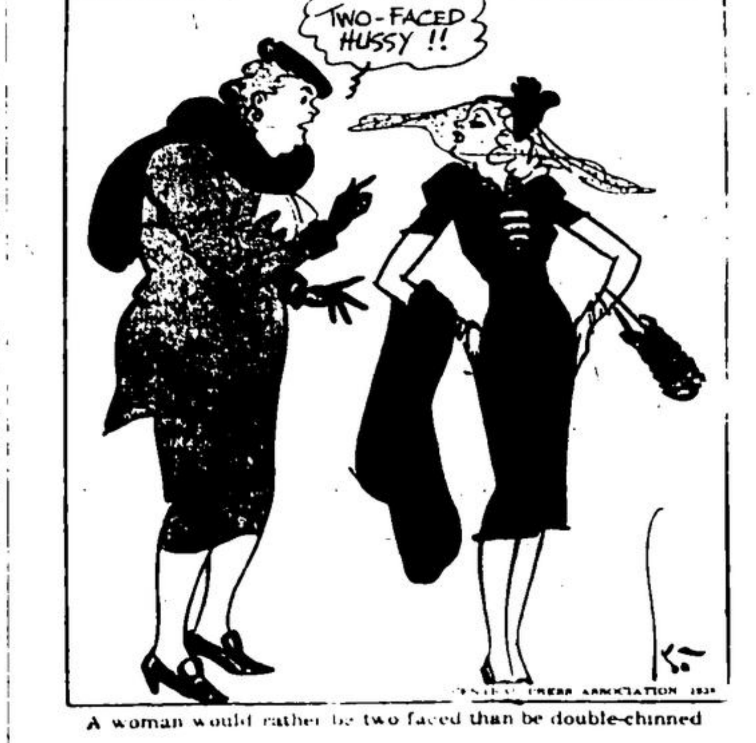
A woman would rather be two faced than be double-chinned

men who owned the real coats in those earlier days had real good time, and the training and exercise they got there helped them to win some of the red and blue ribbons at Esquimaux, Erin and Rockwood Pairs of those times.