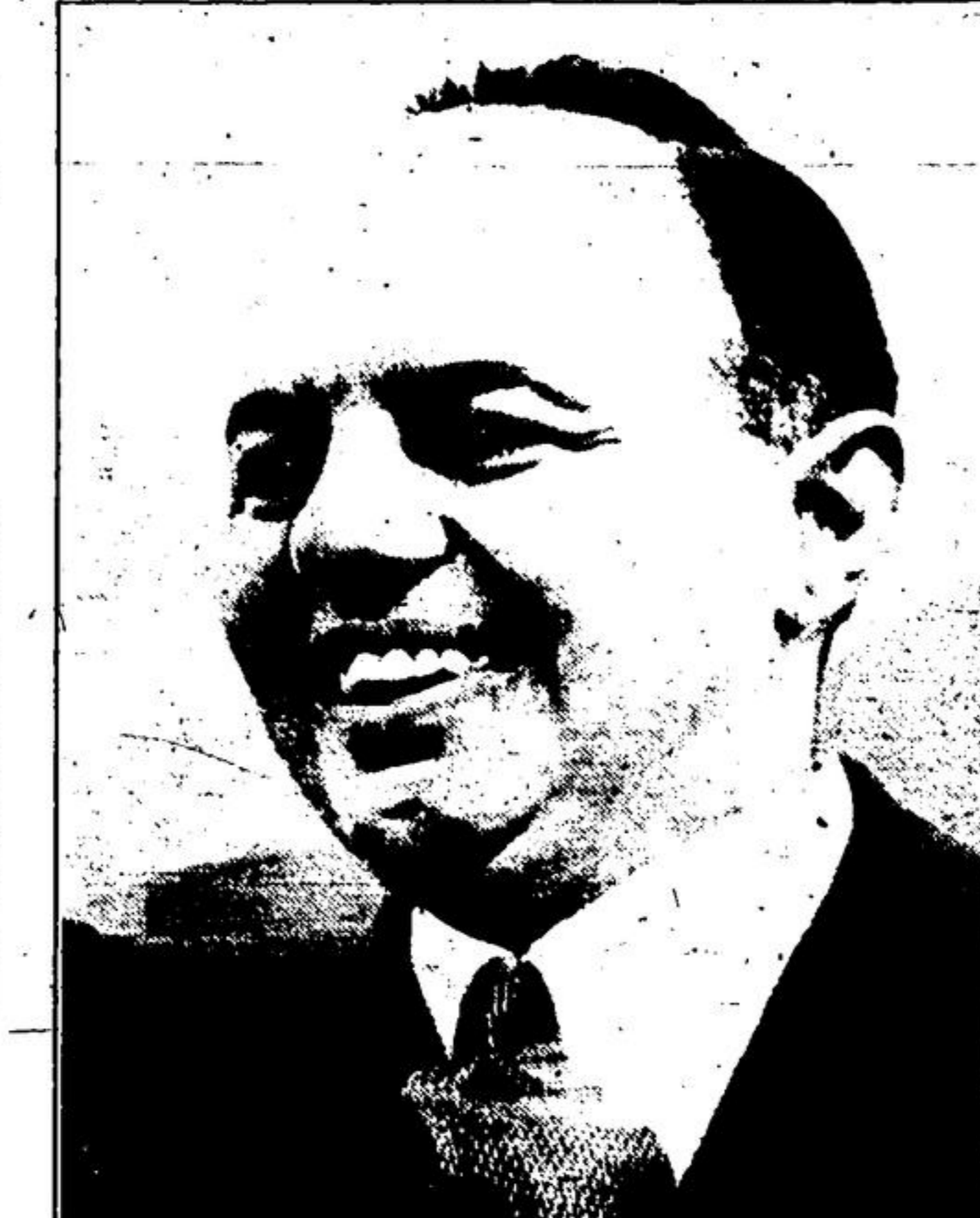
PREMIER MITCHELL F. HEPBURN Given Mandate by Ontario to "Carry On"

organized Cabinet, which the Premier will announce in the next couple of weeks.