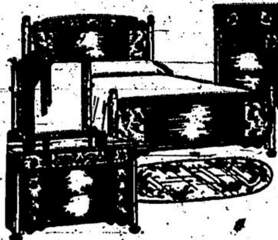
3-PIECE BEDROOM SUITE —On Display— JOHNSTONE & RUMLEY