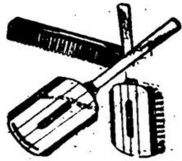
DRESSERWARE or TOILET SET —On Display— A. T. BROWN