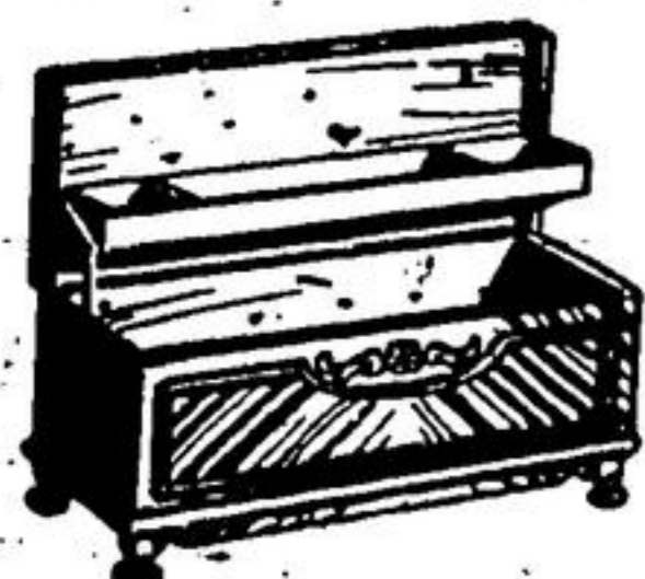
WALNUT CHEST or DAVENPORT COUCH —On Display— JOHNSTONE & RUMLEY