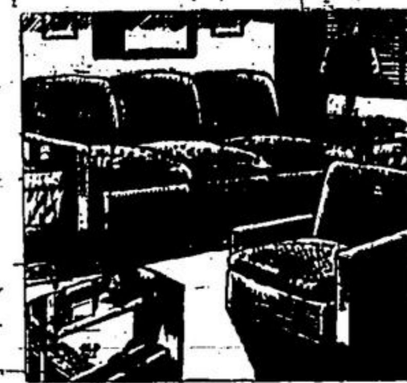
3 Piece CHESTERFIELD SUITE or 8 Piece DINING ROOM SUITE —On Display— JOHNSTONE & RUMLEY