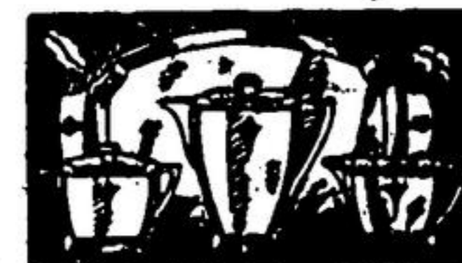
SET OF SILVER or SILVER TEA SERVICE —On Display— SYMON'S HARDWARE