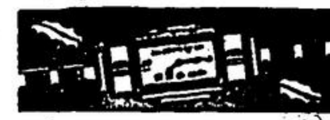
LADY'S or GENT'S WRIST WATCH —On Display— HINTON'S