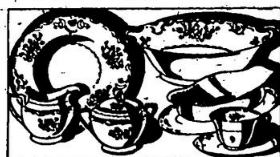
DINNERWARE or BREAKFAST SET —On Display— HINTON'S