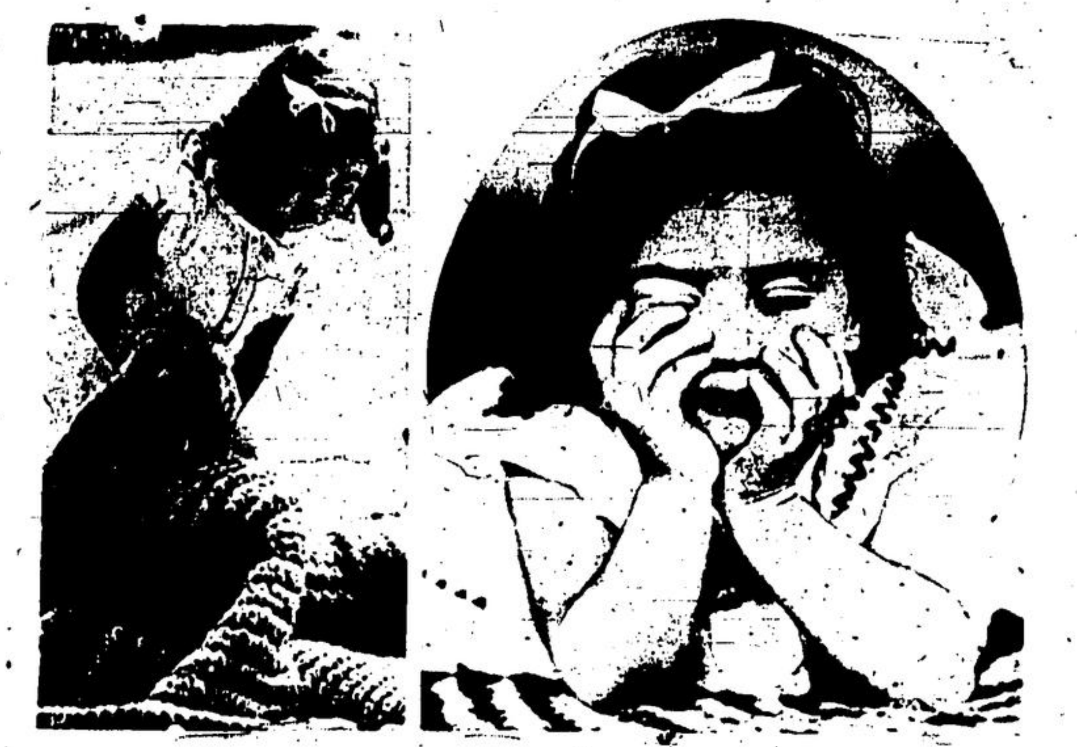
Entertaining their ever-growing public, which just now, with the tourist season at its height means a considerable army of visitors each day, is a wearing business at times for the famous Five of Callander, the Dionne Quintuplets. Like all other good actresses they must have lots of sleep and a mid-day nap is part of their routine.