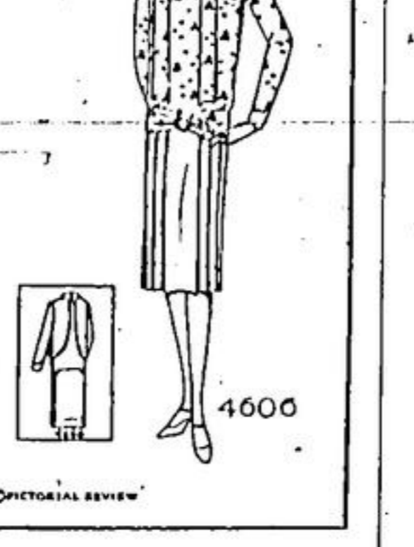
THE SMART BOLERO