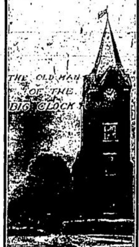
The Old Man