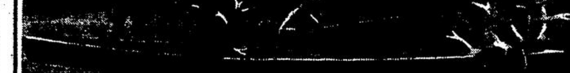
Lower Right—Caught at Last. A giant grizzly, nine and one-half feet from claws to tip of nose, was killed at Bear River, near Barkerville, B.C.