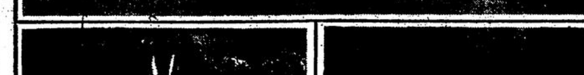
Inset—He Doesn't Want a Ferry. A caribou hunter from shore to shore, coveted antlers up.