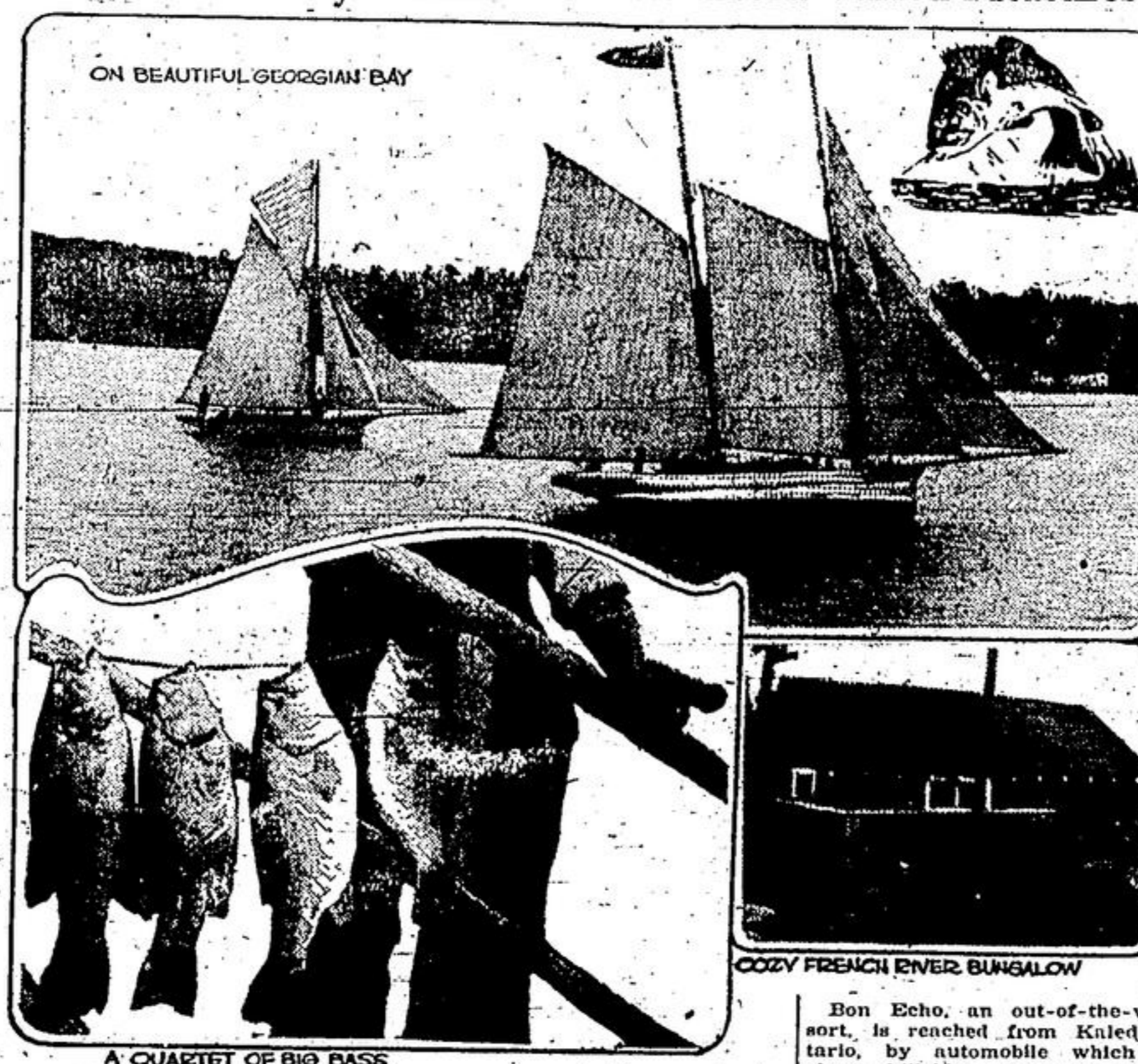
A QUARTET OF BIG BASS

Every summer tens of thousands of visitors seek rest and recreation, health and happiness in the fascinating hinterland of Ontario, where woods and waters abound on every hand, each with its special charm.