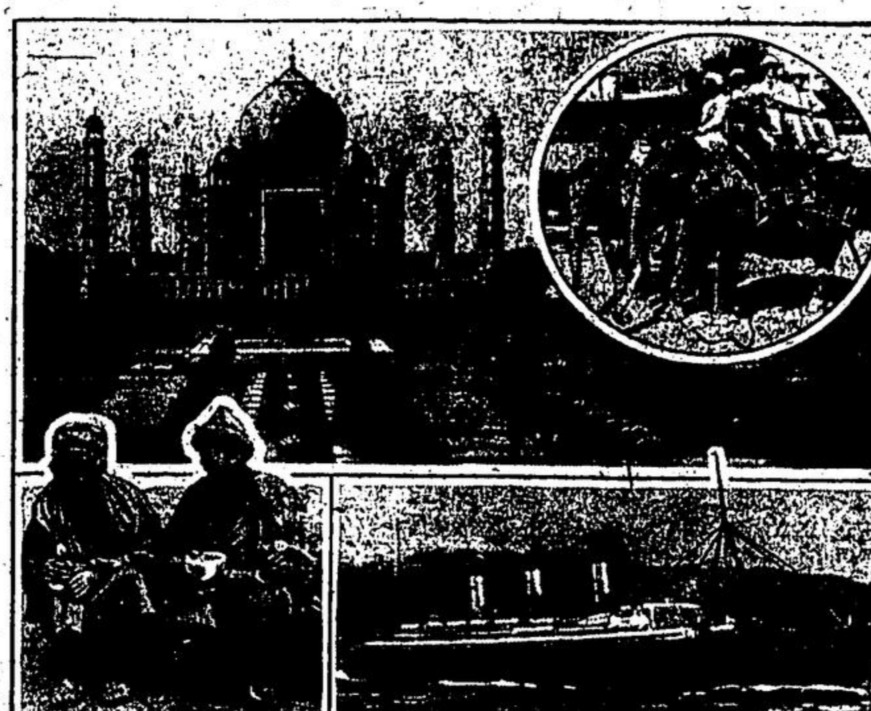
Upper left, Taj Mahal, Agra, India, one of the most beautiful sights on the "Empress" cruise.

Right, "Canada" passengers on one of the yachts that took them from Jaipur to the old city of Amber, India.