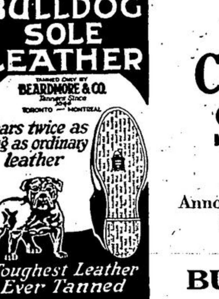
BULLDOG SOLE LEATHER