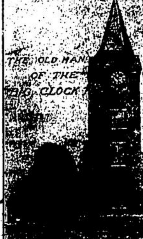
Song of the Old Mill-Wheel