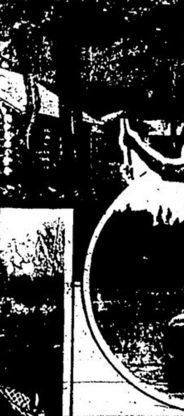
Above, The New Bungalow Camps are Built after this Style.

designed for one, two or four persons, equipped simply but comfortably with a cot, bed and a few other accessories.