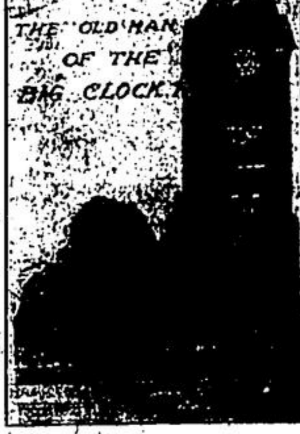
The Old Man and the Clock