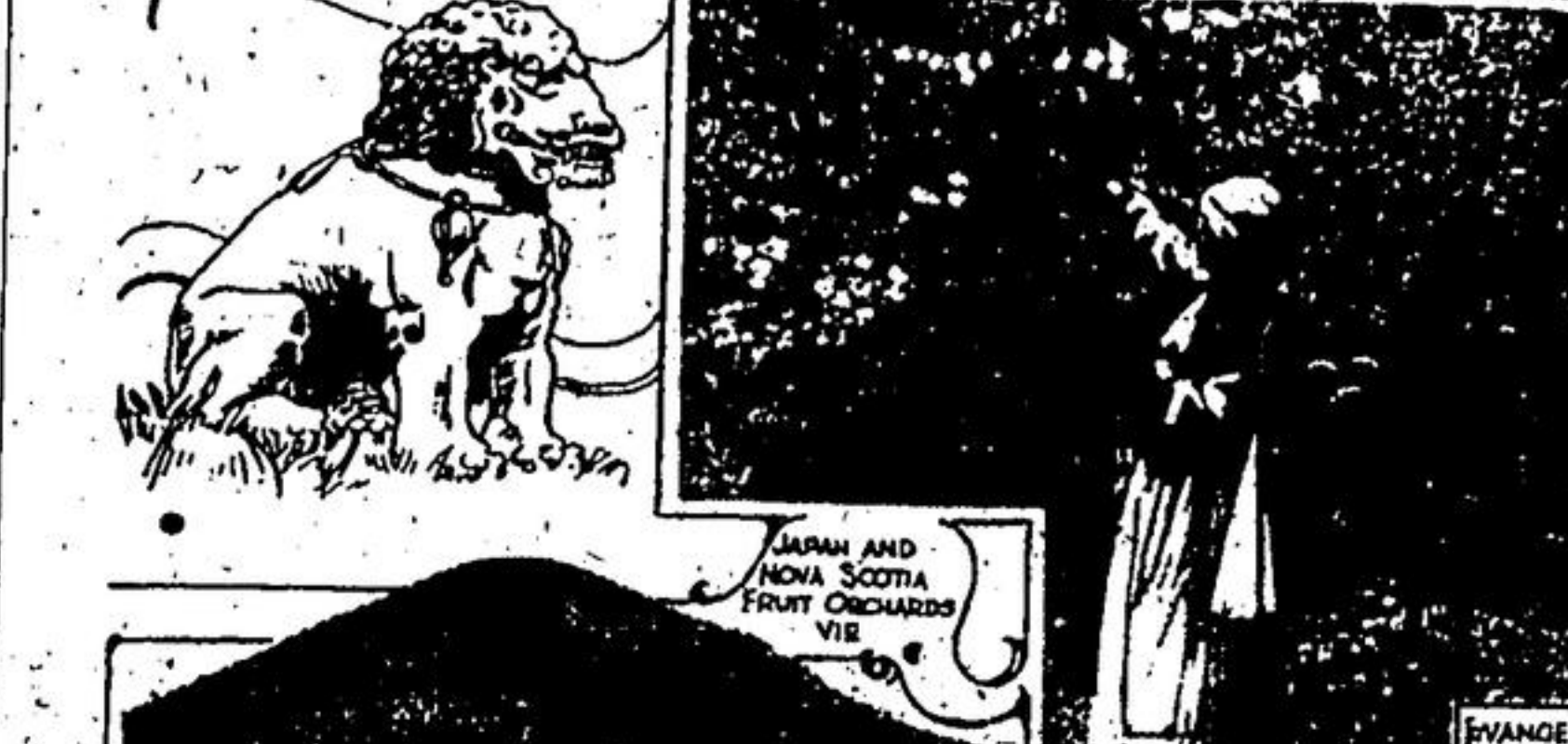
EVANGELINE IN ANNUALS VALLEY ORCHARD