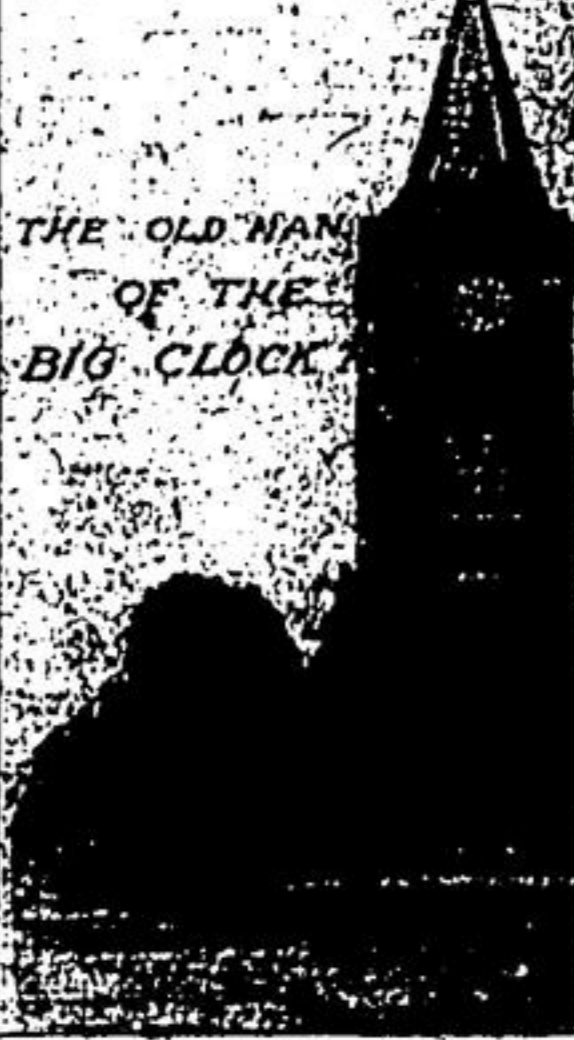
Fifty or Sixty Years On