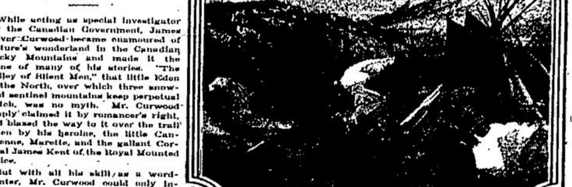
While acting as special investigator for the Canadian Government, James Oliver Curwood became enamored of Nature's wonderland in the Canadian Rockies.