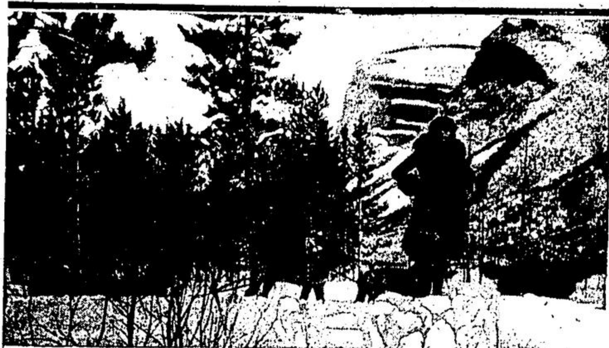
The upper picture is Alma Rubens, who plays the part of "Margaret" in "The Valley of the Blunt Men," and a dog team in the Canadian Rockies at Banff, Alberta.