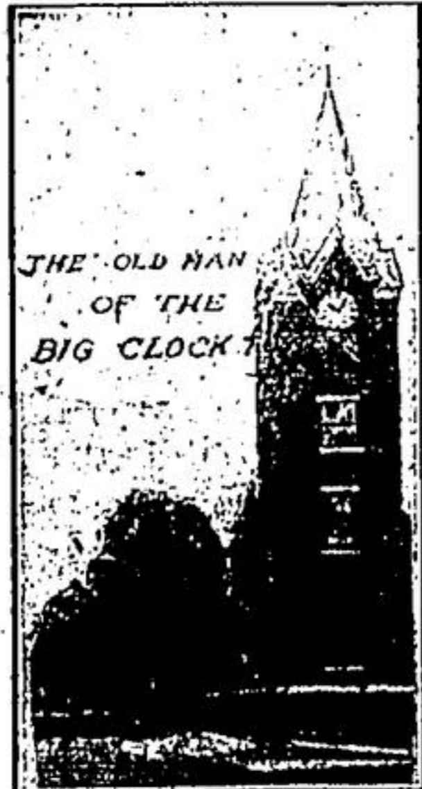
"The Old Man's Reveries and Poetic Fancies"