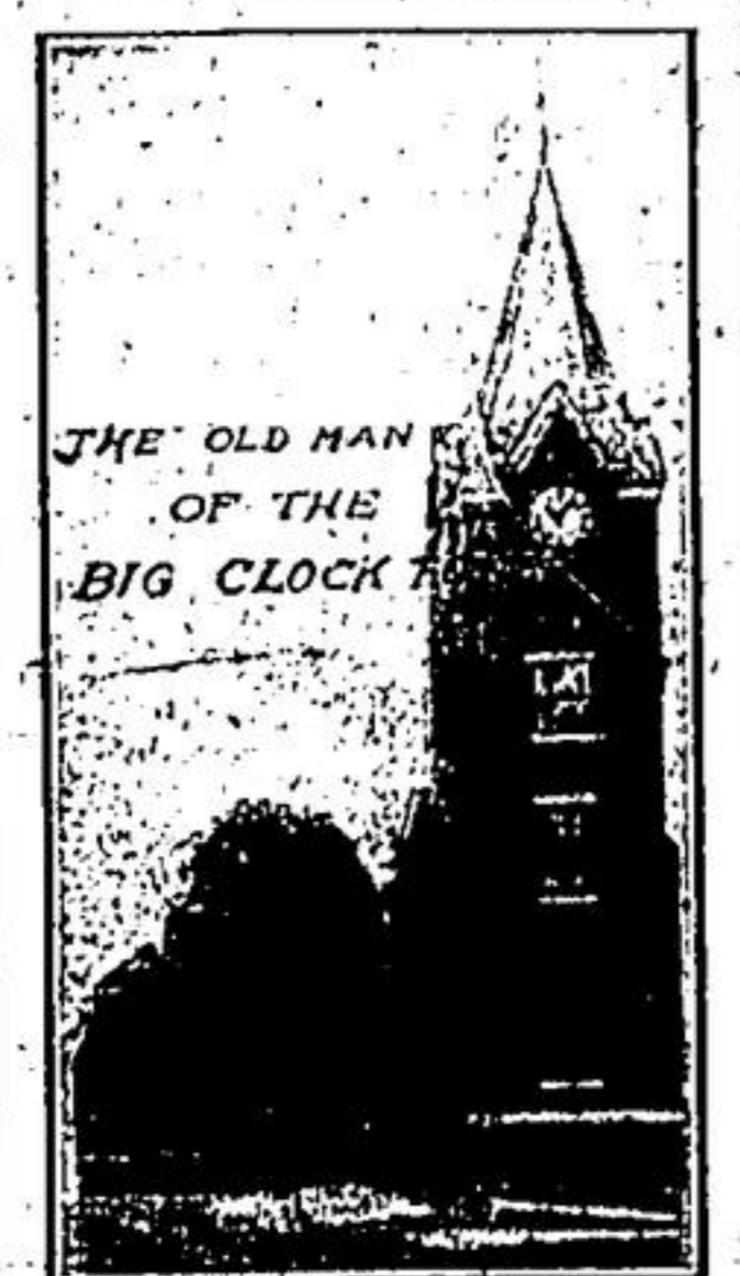
THE OLD MAN OF THE BIG CLOCK