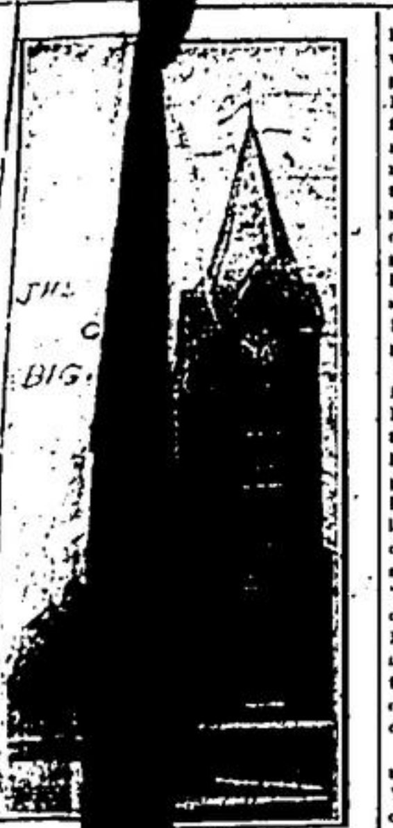
The Old Man

"THE TIME WE'D TRY TO KEEP 'EM. When other people call us names, it does not matter particularly. But when we call other names, it is a serious matter. Really if we are in earnest, another person may call us a fool and excoriate a little natural filth of reasoning on our part, but if we mean to keep calm when we are called a fool, we are permitting the soft confidence which the foundation for our life built. Others may pronounce us wrong, and we may be wrong; but when we are called a fool, we are mistaken. It is a confusion of names. We should not be so serious. We should not be so serious. We should not be so serious. We should not be so serious.