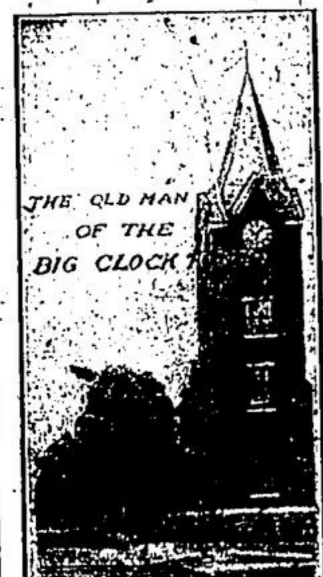
THE OLD MAN OF THE BIG CLOCK