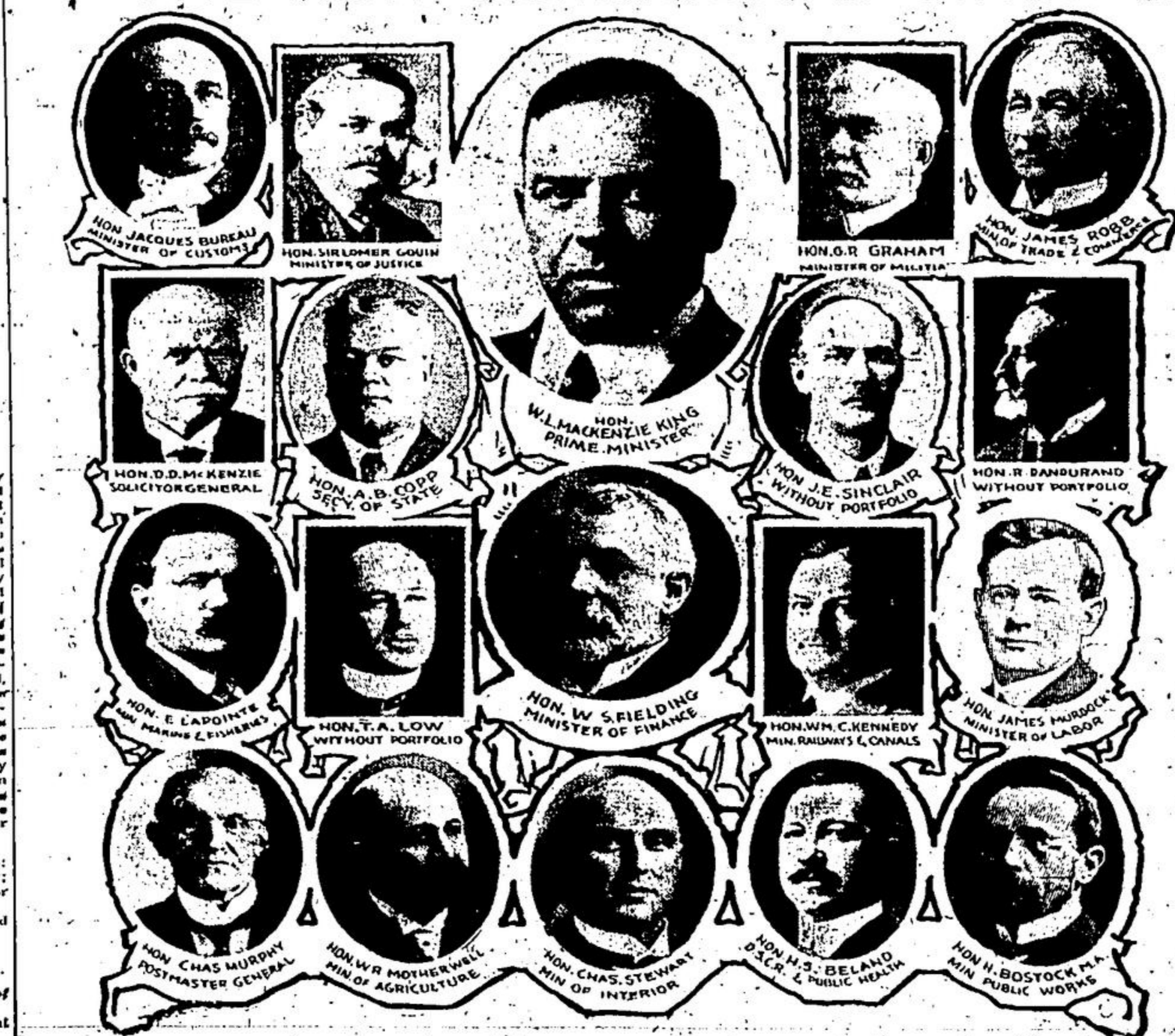
THE NEW DOMINION CABINET

blatter are gone and fine people they are. Five sturdy sons and a daughter still live here and they are all selected citizens.